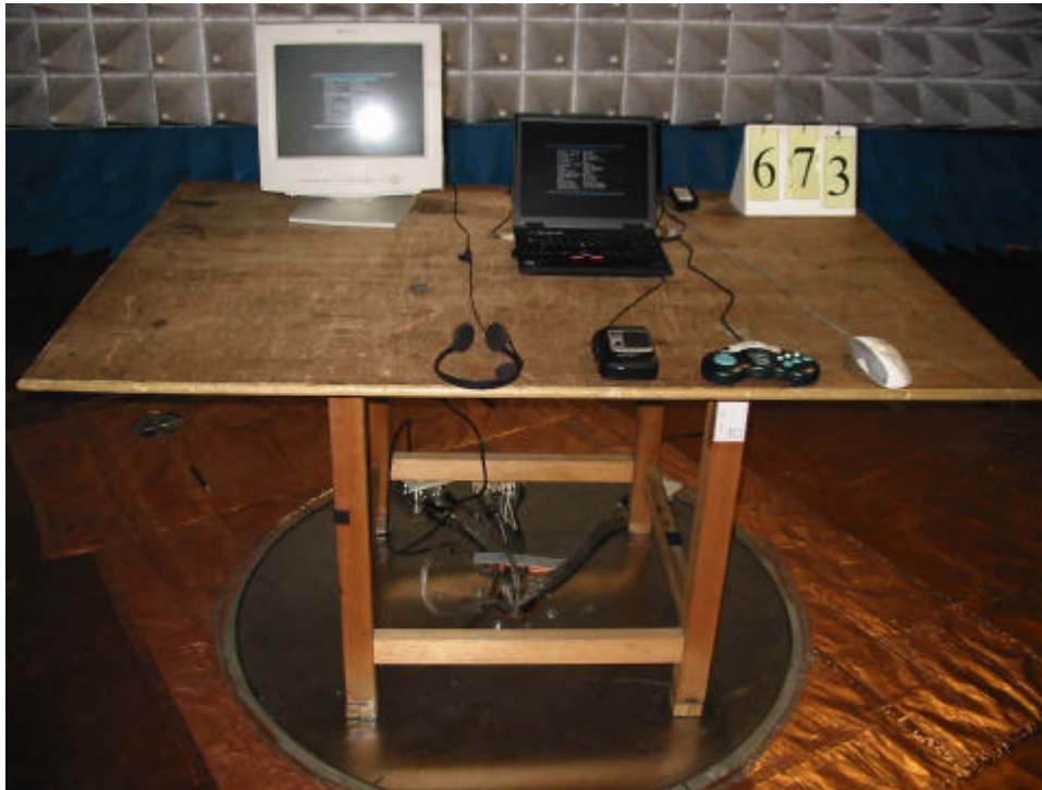
Front View of the Test Configuration