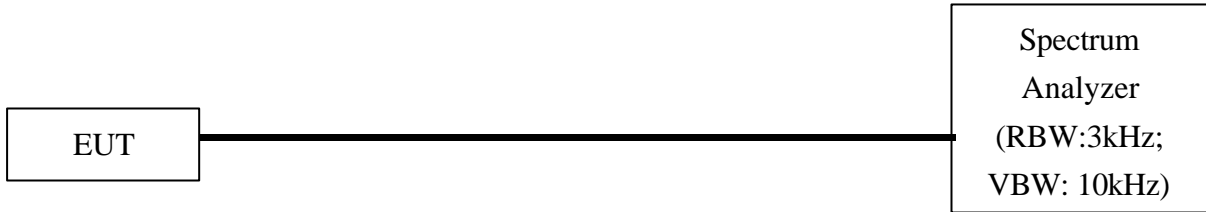
Test Configuration of Power Spectral Density

P.S.: Notebook computer to control the EUT at maximal power output and channel number and set antenna kit