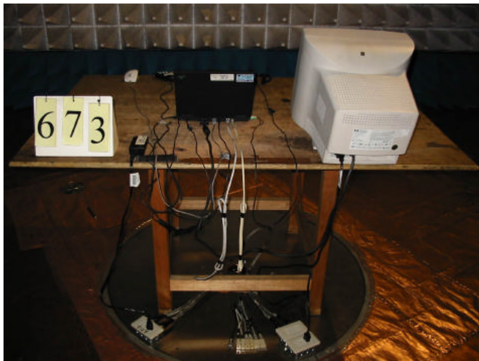
Rear View of the Test Configuration

The test configuration for frequency between 1GHz to 18GHz is same as above.