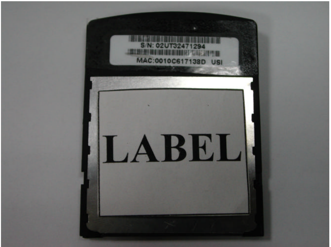
Label Location of USI 802.11b CompactFlash Card