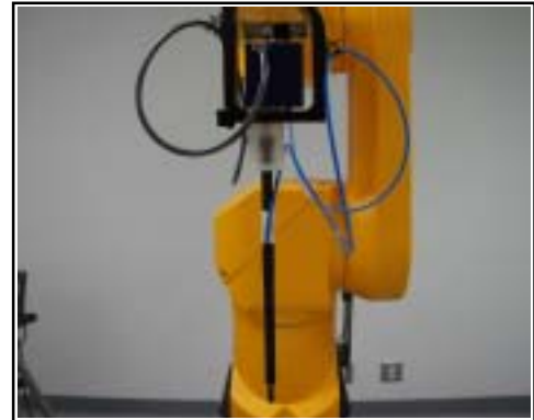
Photograph of the Probe

The SAR measurements were conducted with the dosimetric probe ET3DV6 designed in the classical triangular configuration and optimized for dosimetric evaluation. The probe is constructed using the thick film technique, with printed resistive lines on ceramic substrates. The probe is equipped with an optical multi-fiber line ending at the front of the probe tip. It is connected to the EOC box on the robot arm and provides an automatic detection of the phantom surface. Half of the fibers are connected to a pulsed infrared transmitter, the other half to a synchronized receiver. As the probe approaches the surface, the reflection from the surface produces a coupling from the transmitting to the receiving fibers. This reflection increases first during the approach, reaches maximum and then decreases. If the probe is flatly touching the surface, the coupling is zero. The distance of the coupling maximum to the surface is independent of the surface reflectivity and largely independent of the surface to probe angle. The DASY4 software reads the reflection during a software approach and looks for the maximum using a 2nd order fitting. The approach is stopped when reaching the maximum.