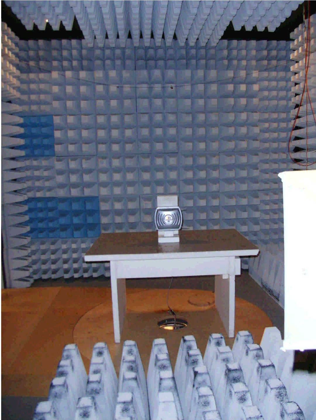
91187_18.jpg TSU25, test setup fully anechoic chamber

Annex A of test report F091187E4 EUT: TSU25 Manufacturer: deister electronic GmbH