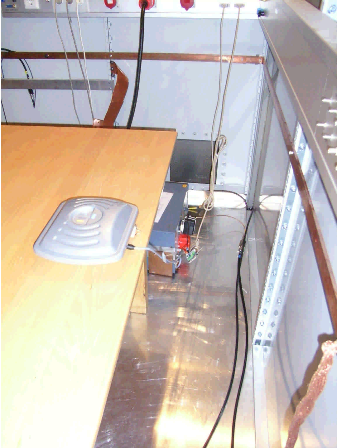
91187_10.jpg TSU25, test setup shielded chamber

Annex A of test report F091187E4 EUT: TSU25 Manufacturer: deister electronic GmbH