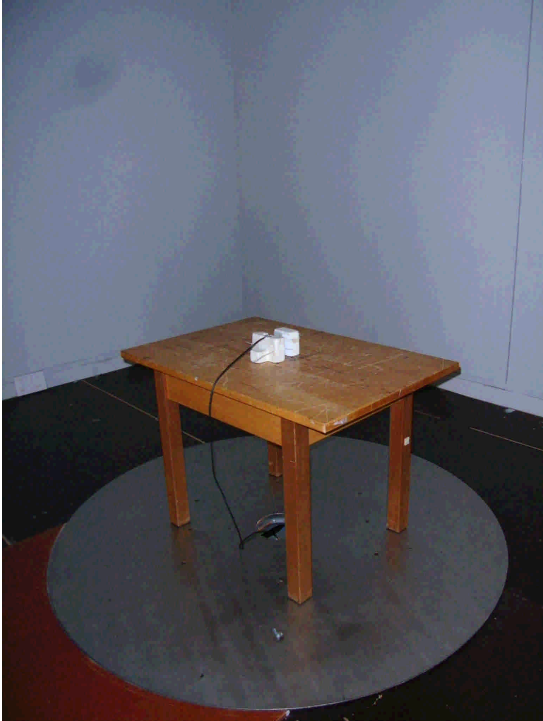
91567_22.jpg SWH-4130, test set-up open area test site

Annex A of test report F091567E2 EUT: SWH-4130 Manufacturer: deister electronic GmbH