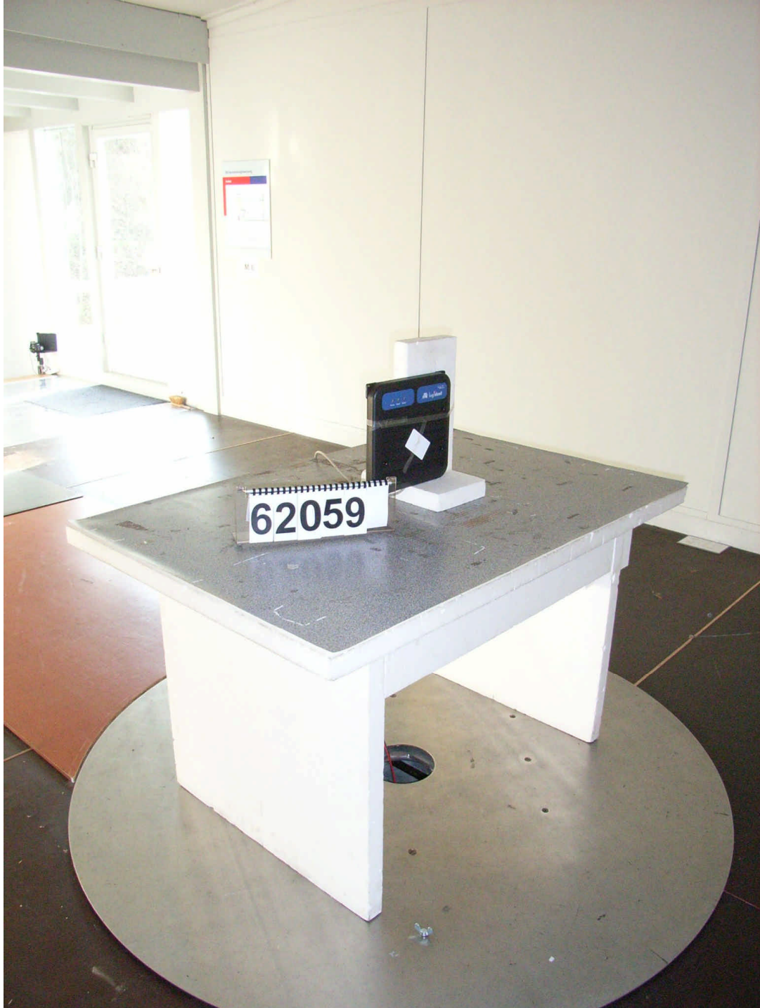
62059_11.jpg RDL 150, test set-up open area test site

Annex A of test report R62059 Edition 1 EUT: RDL 150 Manufacturer: deister electronic GmbH