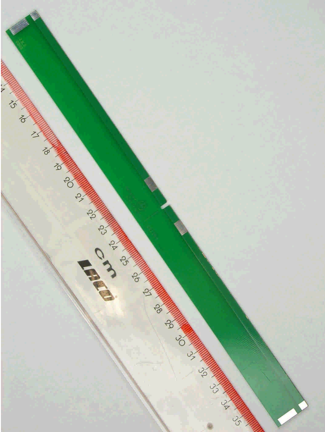
81232_11.jpg PRM15 / SWH2400, antenna PCB, top view

Annex B of test report F081232E01 EUT: PRM15 / SWH2400 Manufacturer: deister electronic GmbH