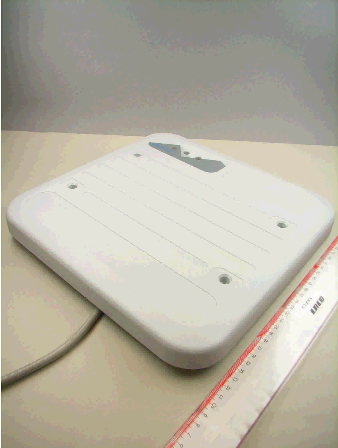
81232_12.jpg PRM15 / SWH2400, 3D-view 1

Annex C of test report F081232E01 EUT: PRM15 / SWH2400 Manufacturer: deister electronic GmbH