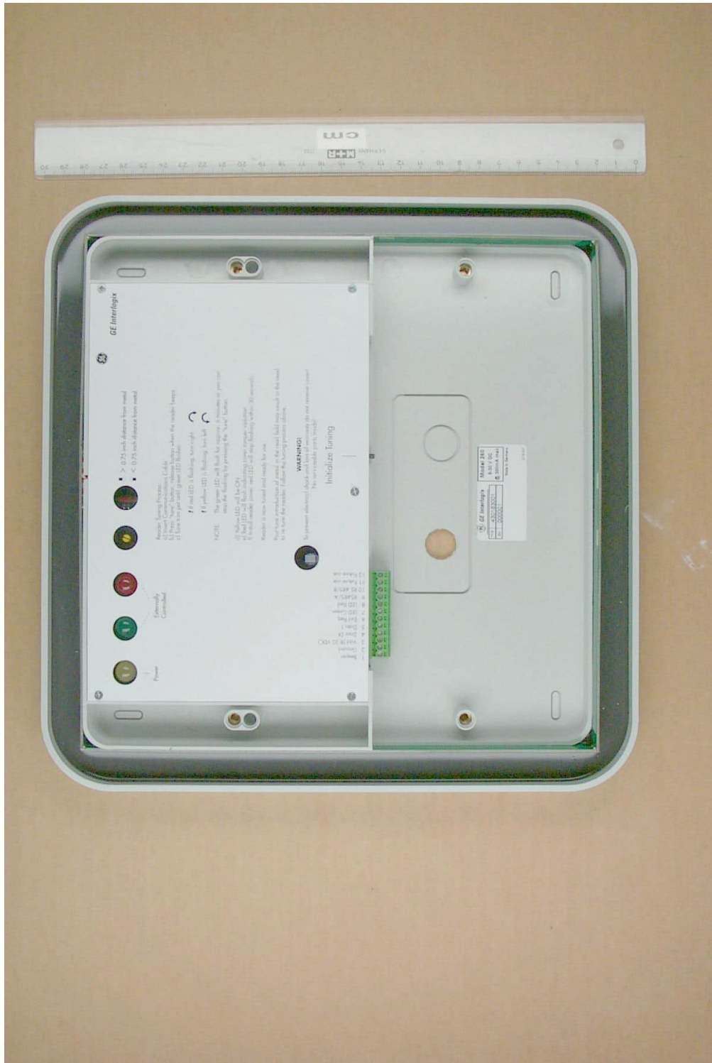
30052eut3.jpg EUT, inside view