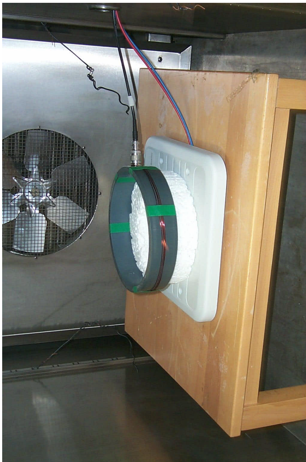
30052clima4.jpg Test set-up climatic chamber