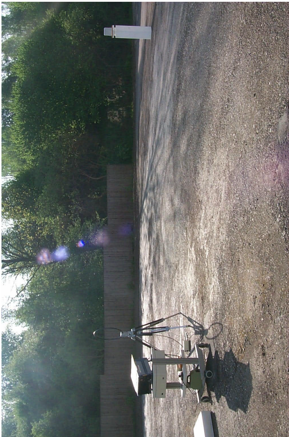
30052emi_ff4.jpg Test set-up final emission measurement (9 kHz to 30 MHz)