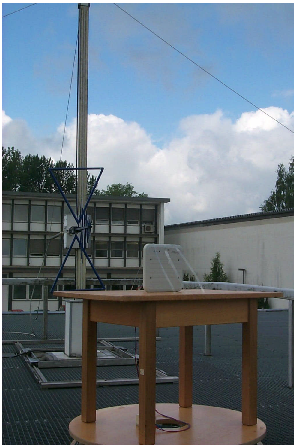
30052ff2.jpg Test set-up final emission measurement (30 MHz to 1 GHz)