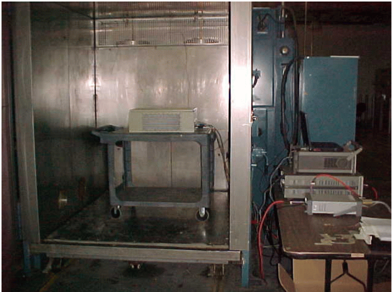
Photograph 7. Frequency Stability (Temperature Variation) Test Setup Photo