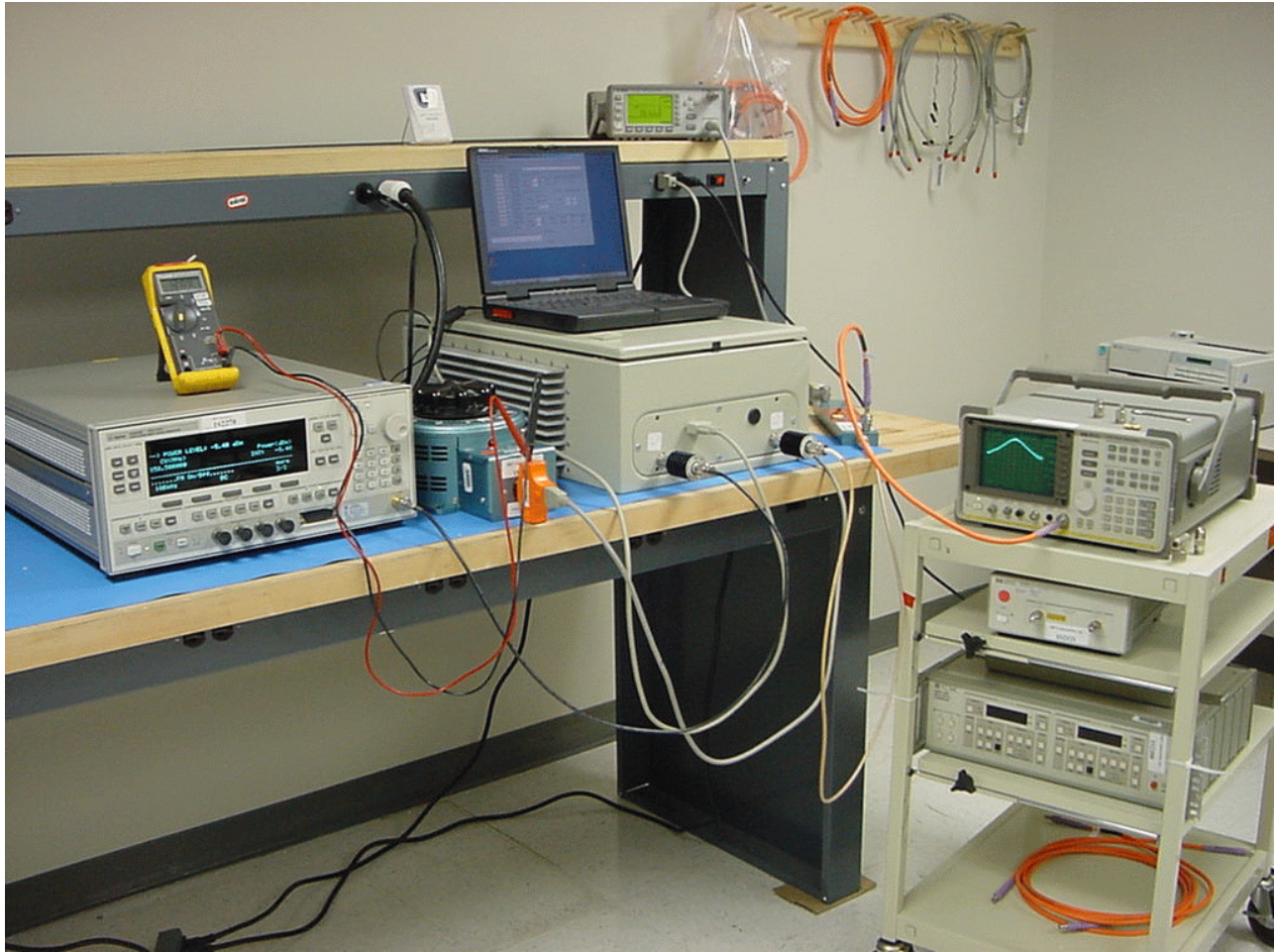
Photograph 8. Frequency Stability (Voltage Variation) Test Setup Photo