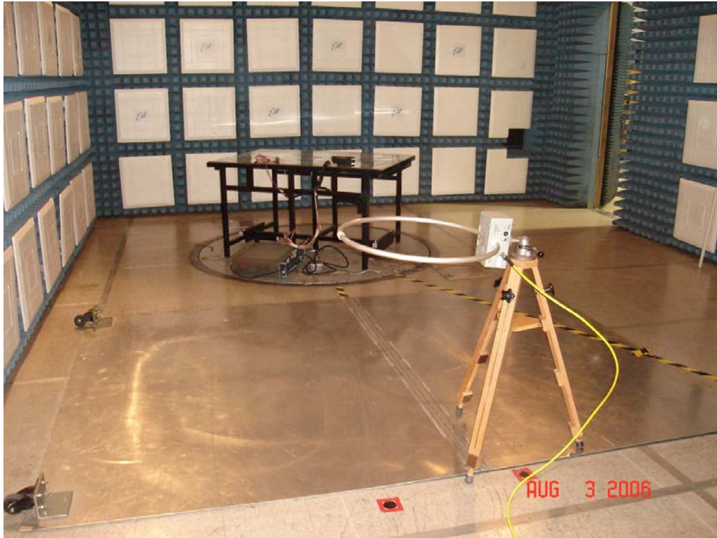
Radiated Emissions Worst Case Horizontal Polarization