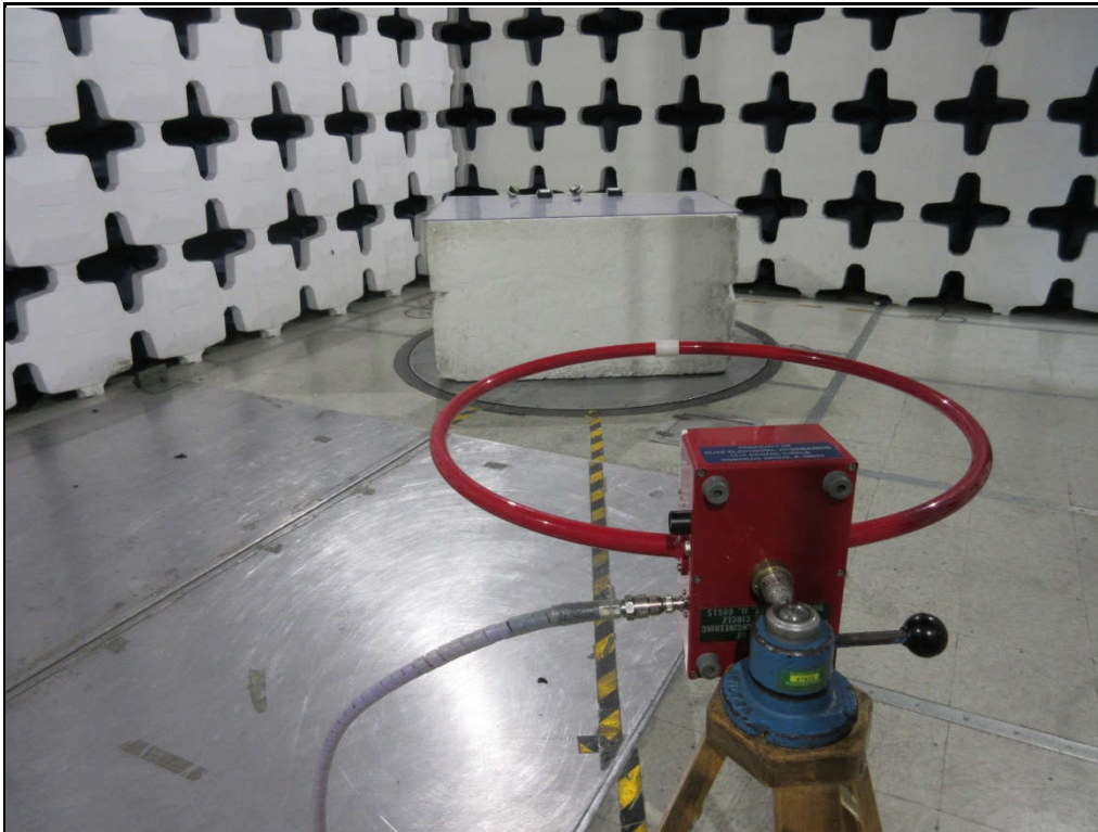
Test Setup for Spurious Radiated Emissions, 10kHz – 30MHz – Antenna Polarization Horizontal