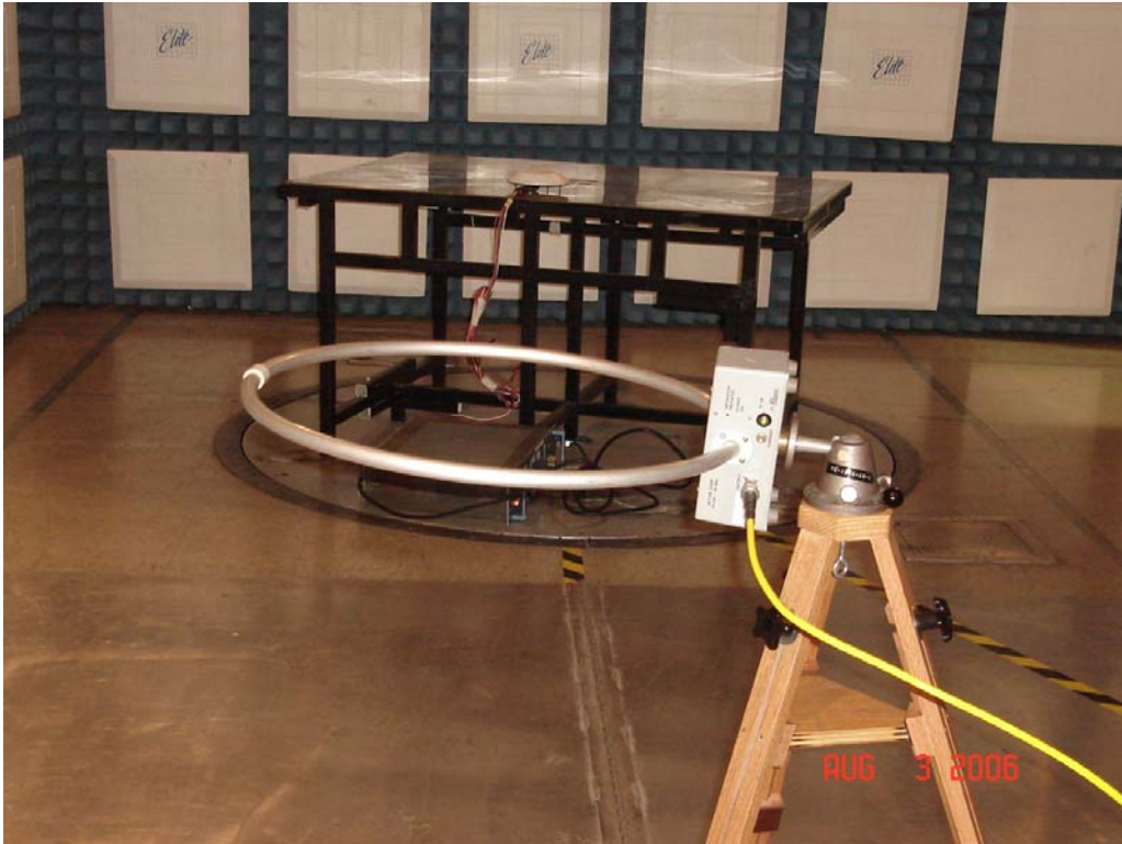
Radiated Emissions Worst Case Horizontal Polarization