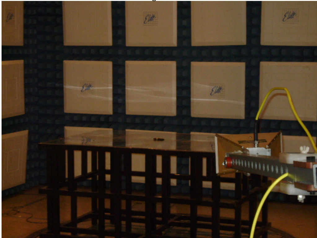
Test Setup for Radiated Emissions – 1GHz to 5GHz, Vertical Polarization