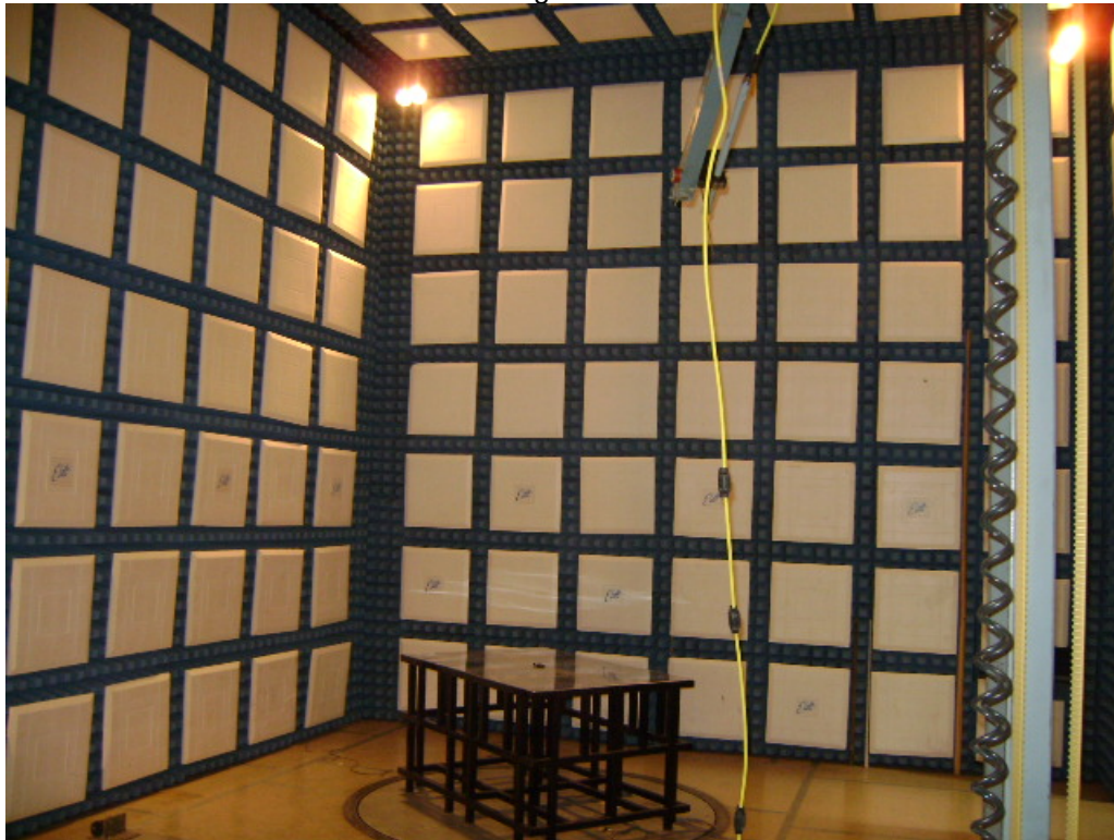
Test Setup for Radiated Emissions – 433.92MHz, Vertical Polarization