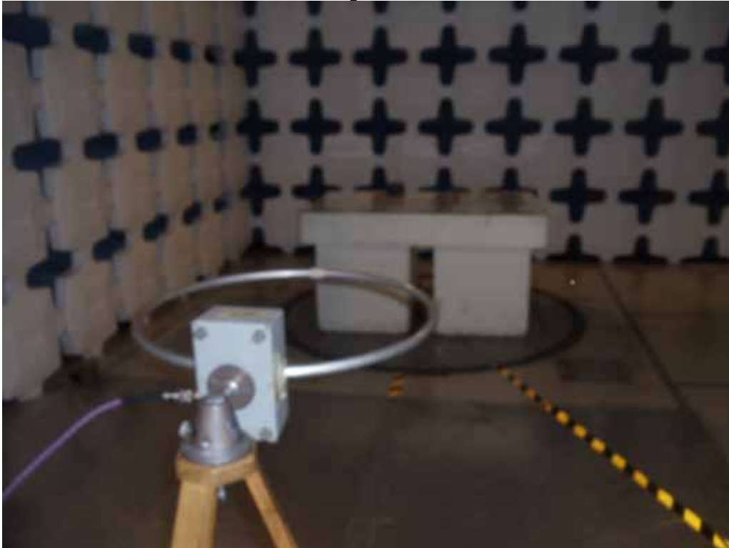
Test Setup for Radiated Emissions, Below 1GHz – Horizontal Polarization With M190-A2 external antenna