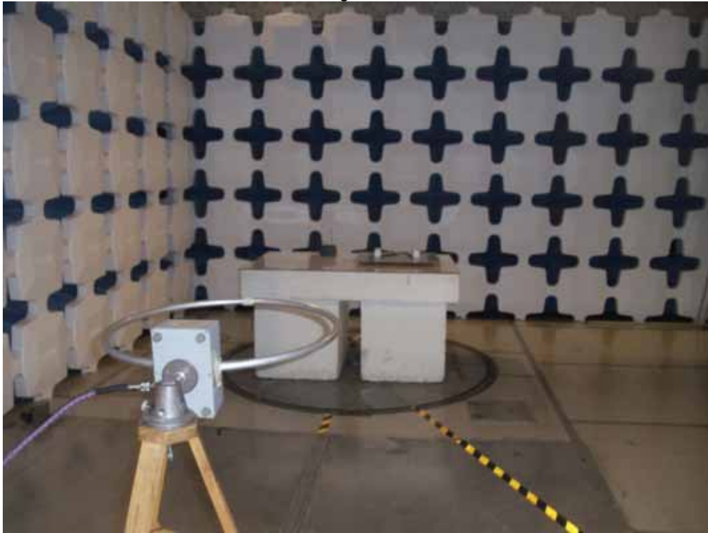
Test Setup for Radiated Emissions, Below 1GHz – Horizontal Polarization With M190-A3 external antenna