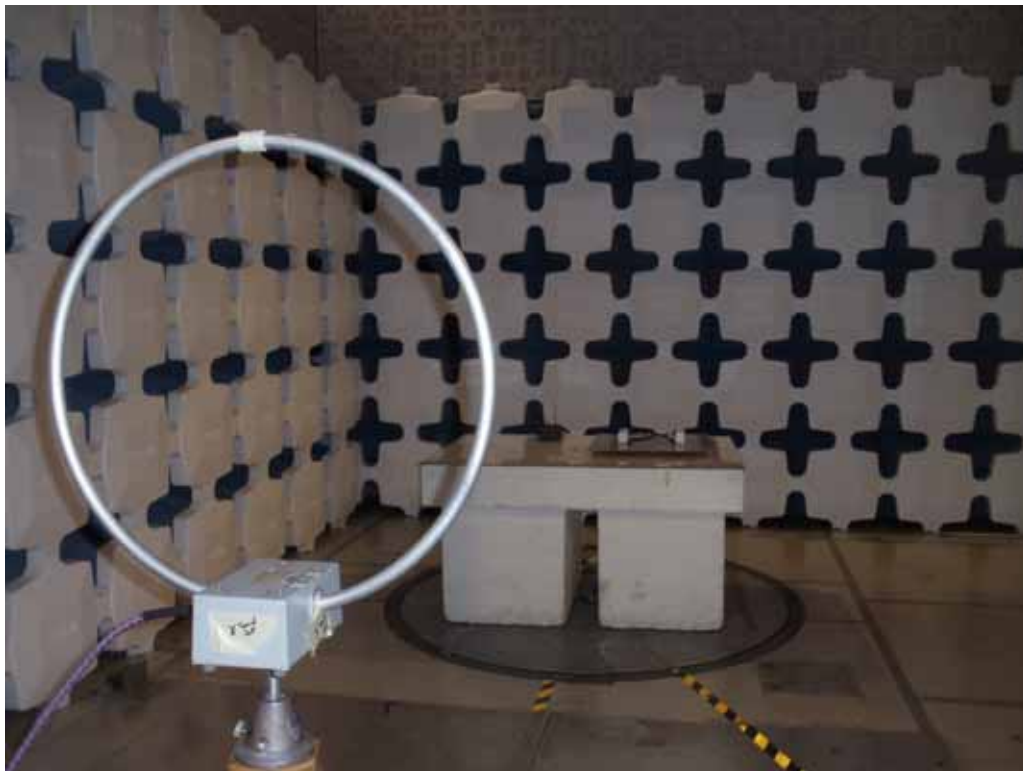
Test Setup for Radiated Emissions, Below 1GHz – Vertical Polarization With M190-A3 external antenna