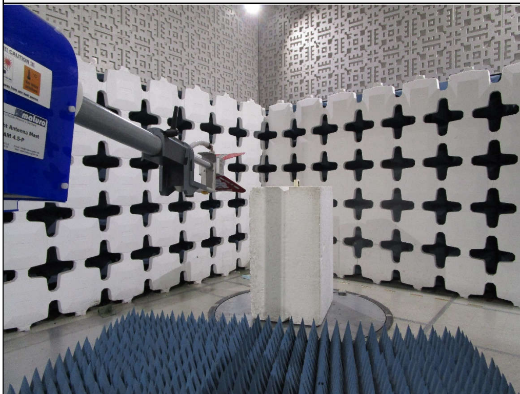
Test Setup for Spurious Radiated Emissions, Above 1GHz – Antenna Polarization Vertical