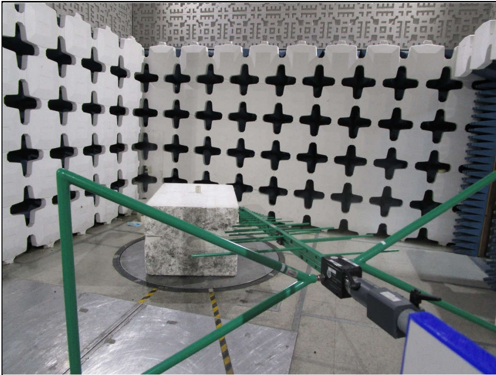
Test Setup for Spurious Radiated Emissions, 30-1000MHz – Antenna Polarization Horizontal