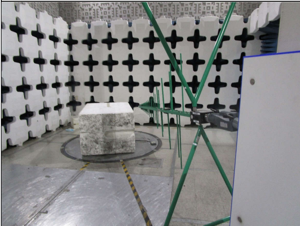
Test Setup for Spurious Radiated Emissions, 30-1000MHz – Antenna Polarization Vertical