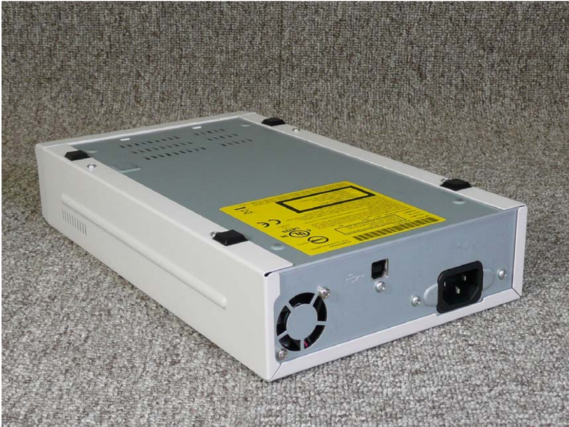
Location of FCC label