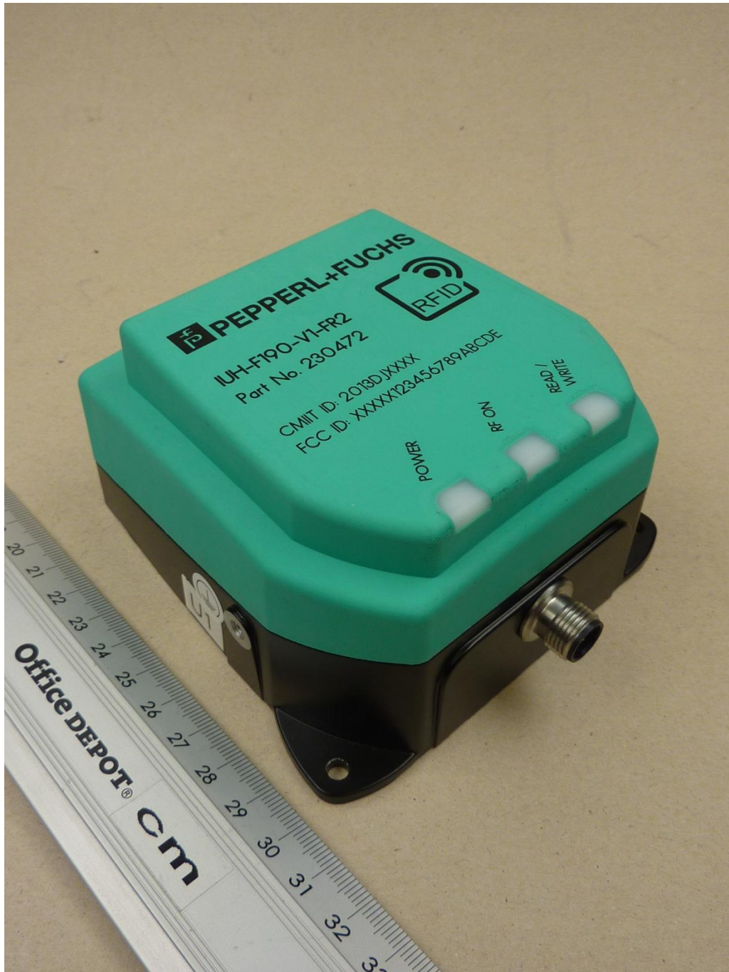
136258_1.JPG: IUH-F190-V1-FR2-02, 3-D-view 1