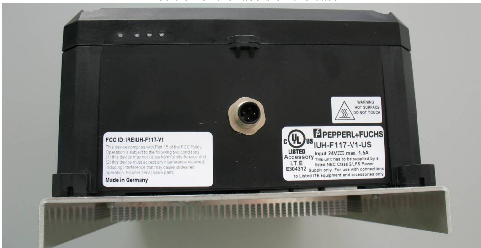
Position of the labels on the case