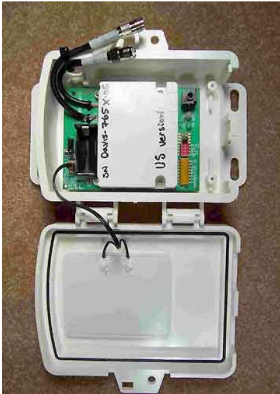
Interior Overall Removeable Antenna Version