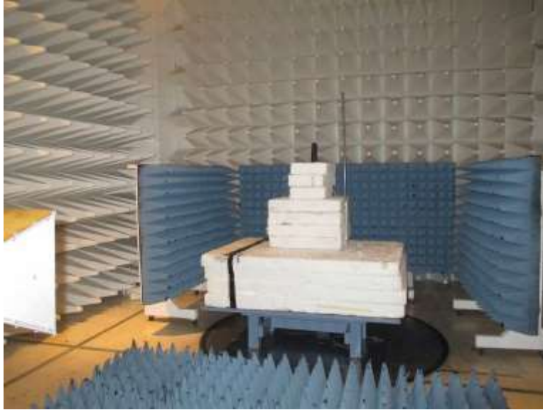
1 – 25GHz, Cone placement