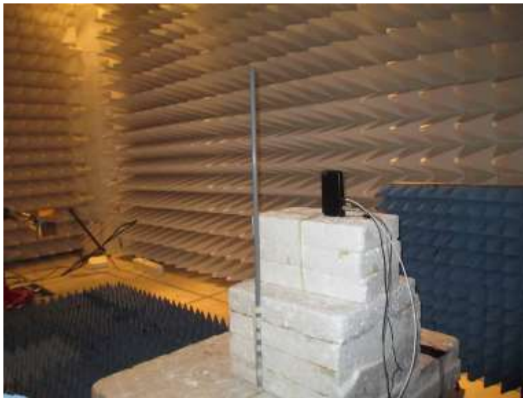
1 – 25GHz, Cone placement