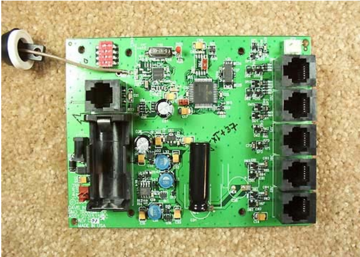
PCB Front Wide