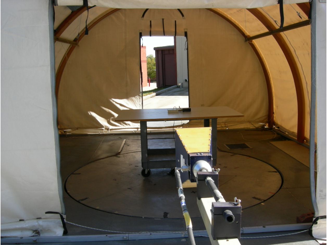
Figure 3: Radiated Emissions