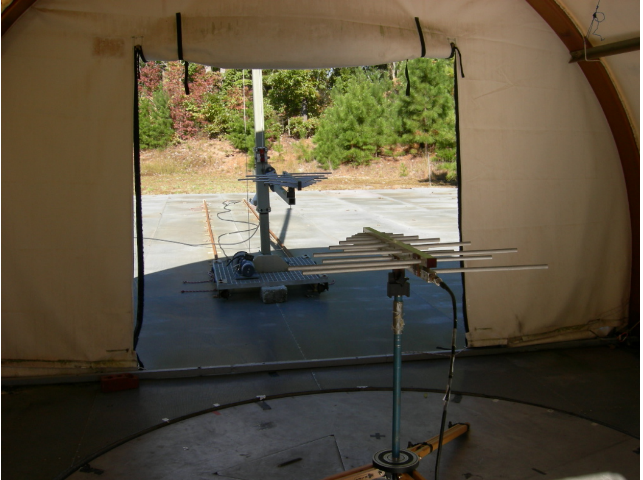
Figure 4: Radiated Emissions (Substitution)