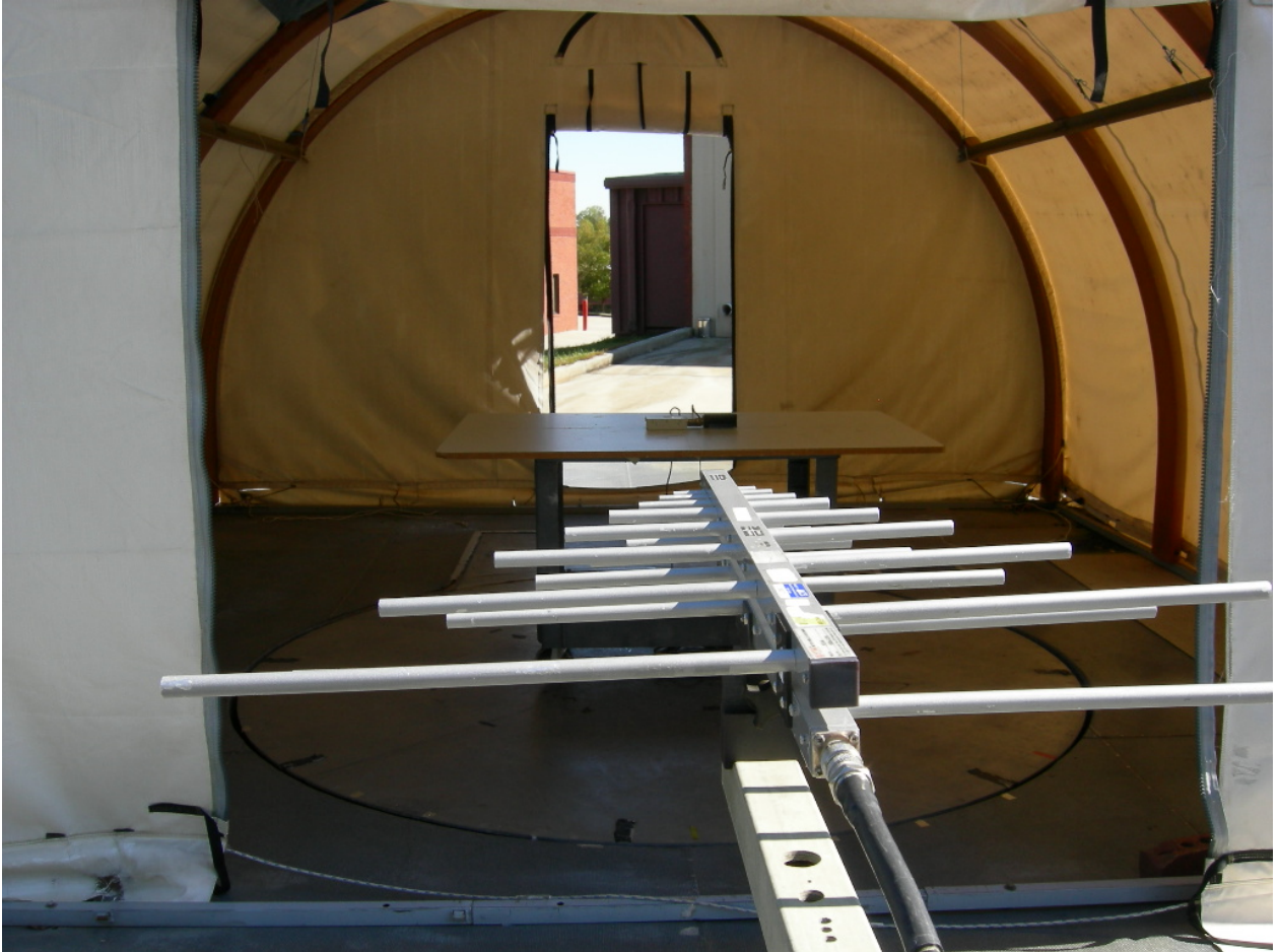
Figure 2: Radiated Emissions