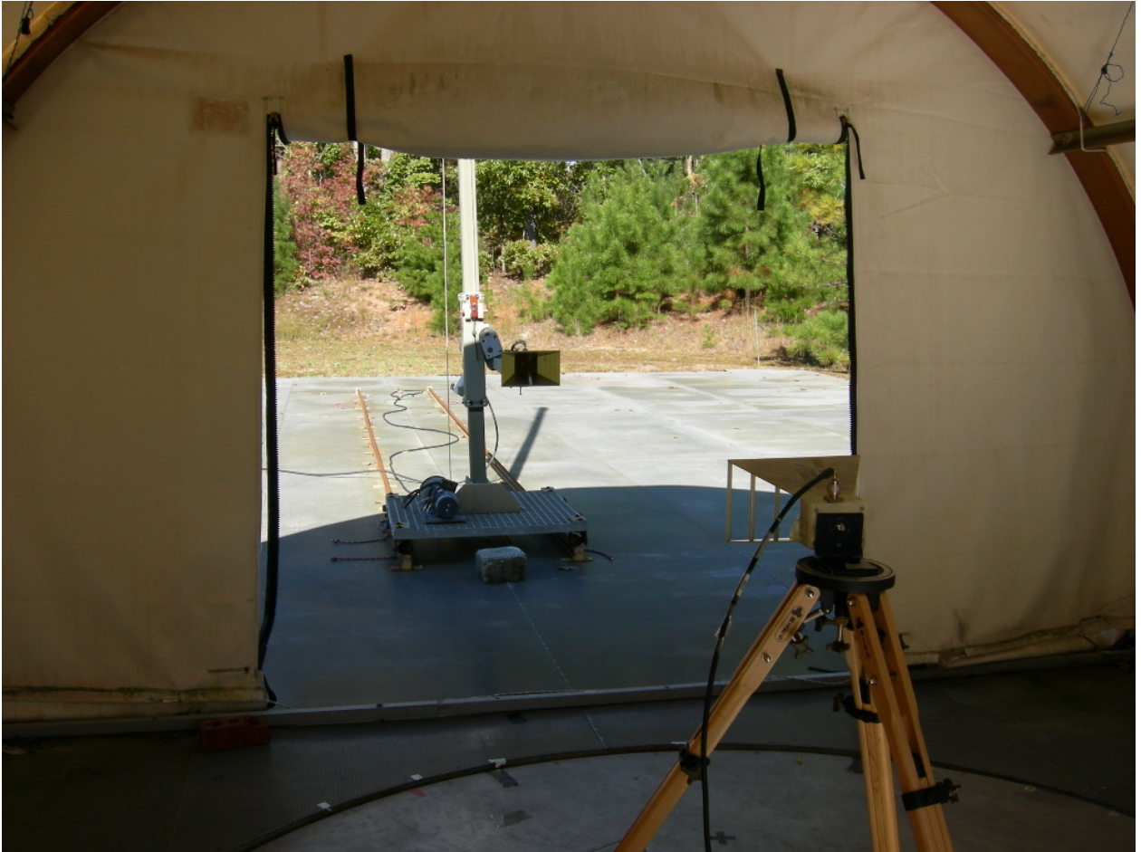
Figure 5: Radiated Emissions (Substitution)