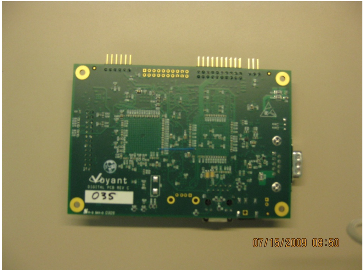
Figure 2: Digital PCB – Back