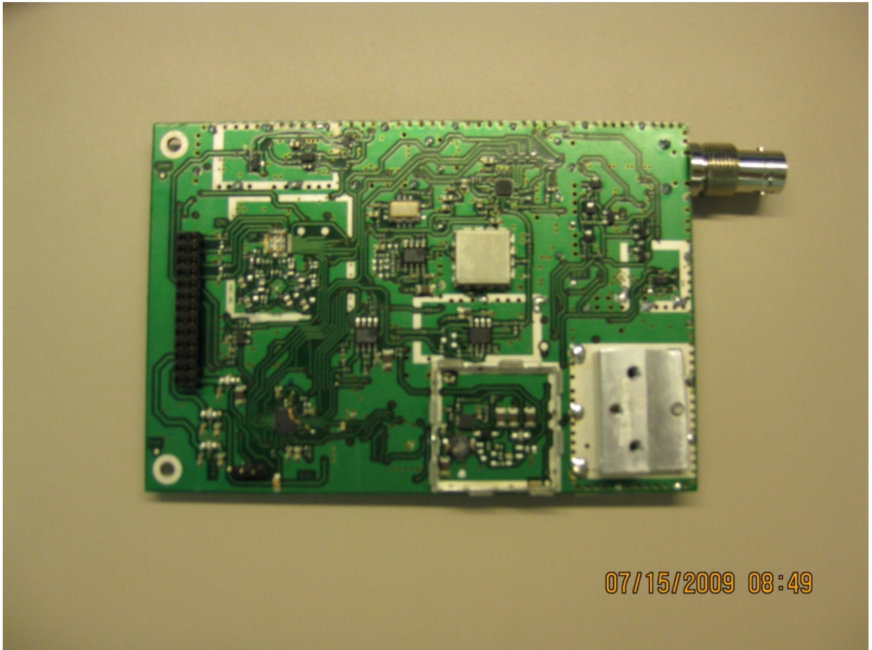
Figure 6: RF PCB without Shields - Back