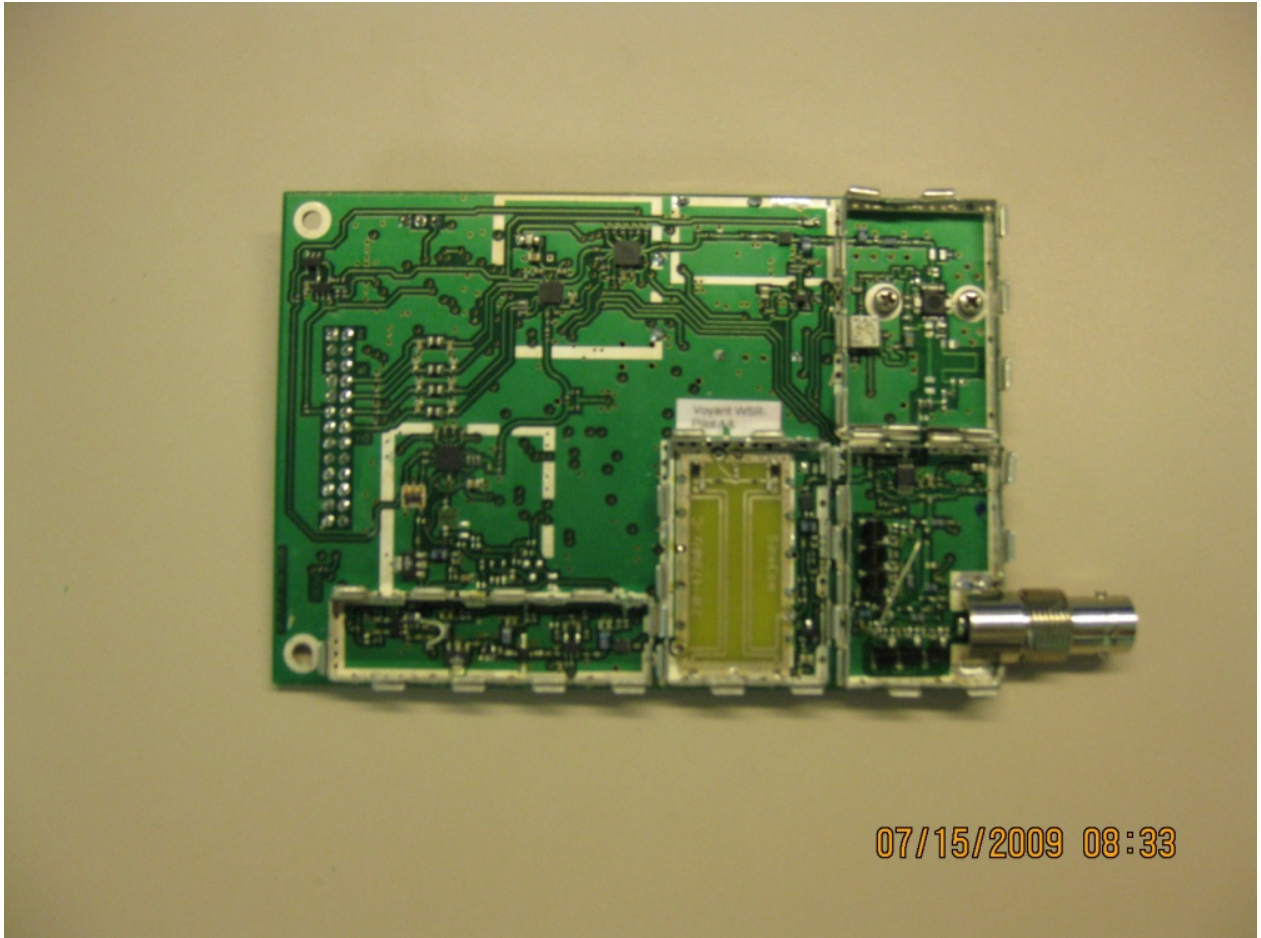
Figure 4: RF PCB without Shields - Front