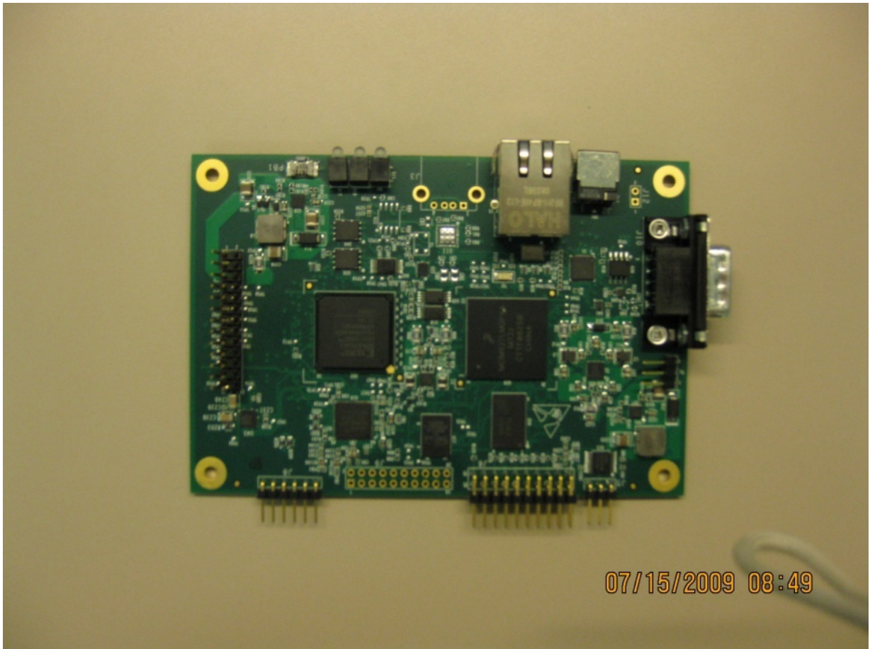
Figure 1: Digital PCB - Front