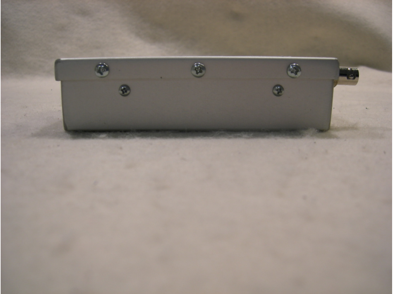
Figure 6: Side