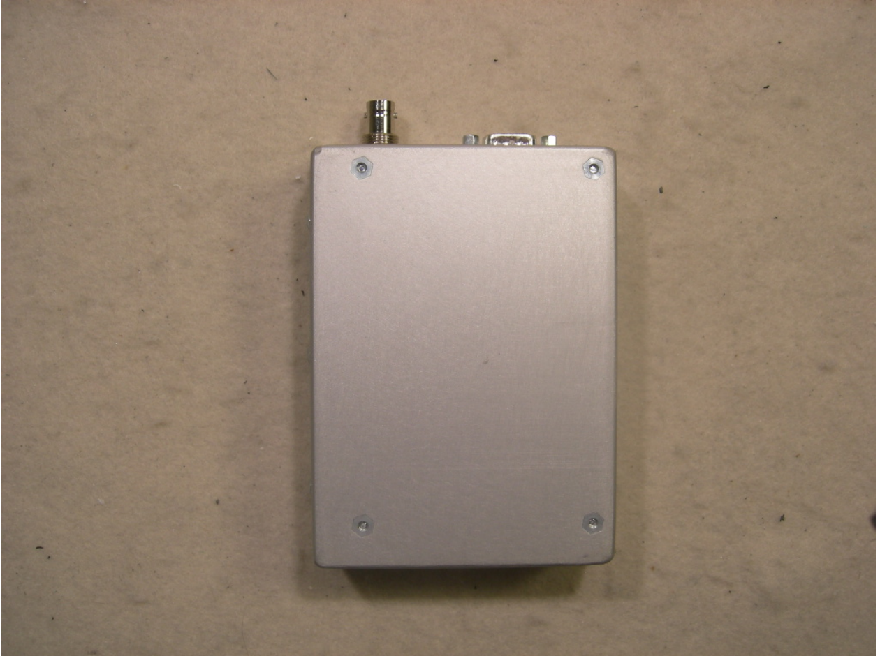
Figure 2: Bottom