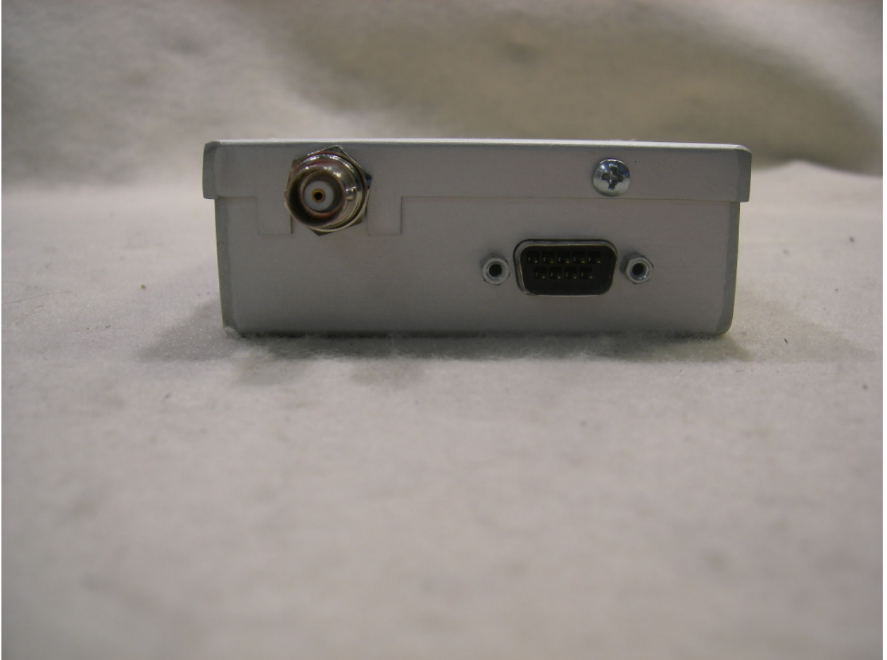
Figure 3: Front