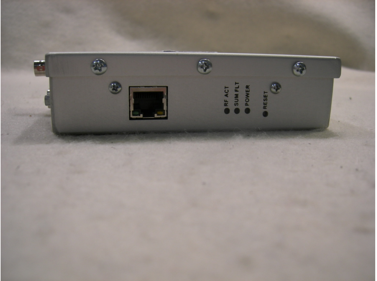
Figure 5: Side