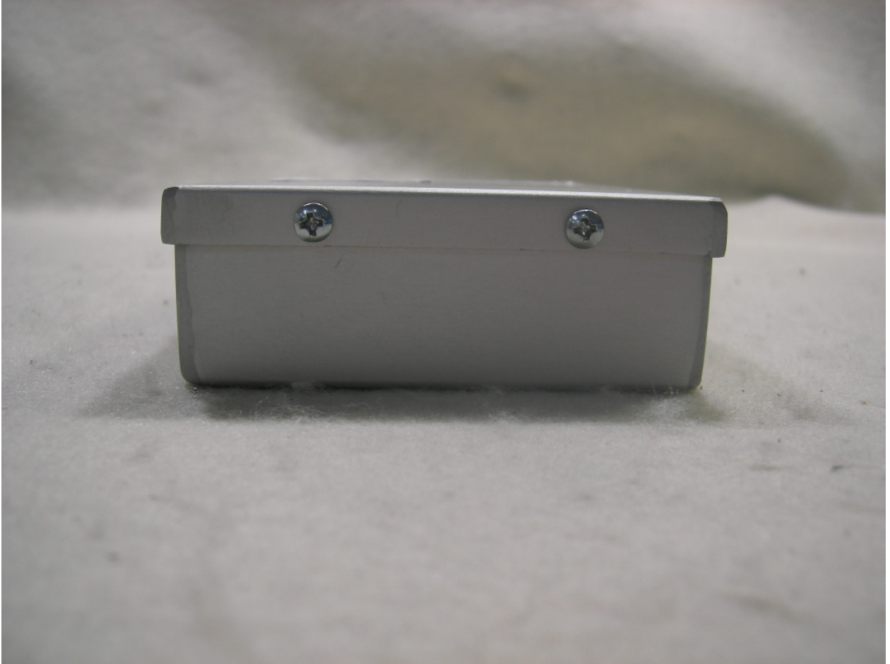
Figure 4: Back