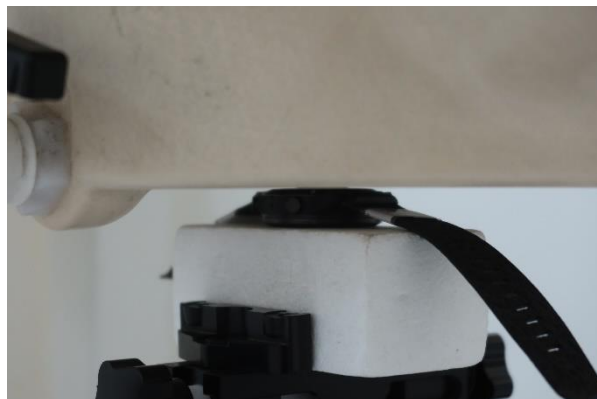
Back at 0 mm