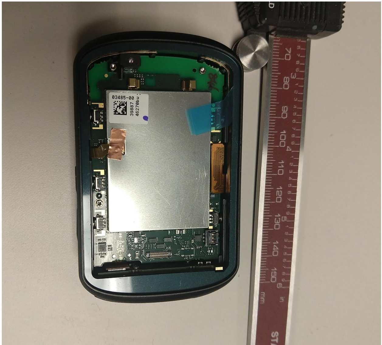
Top of PCB with cover on shielded enclosure.