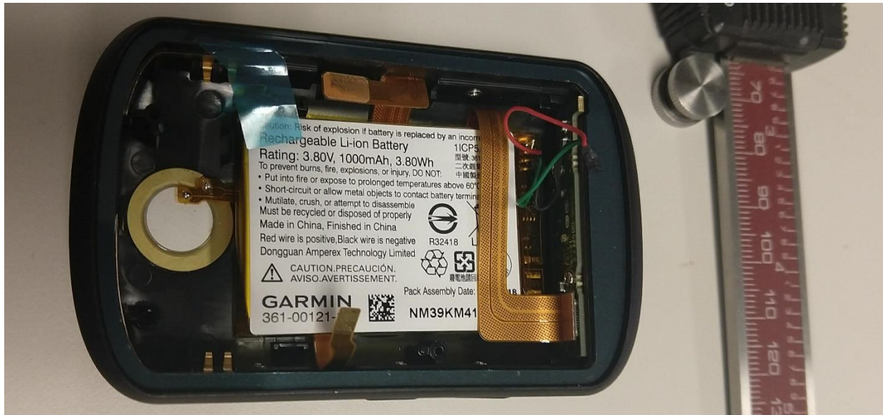
PCB removed to show battery.