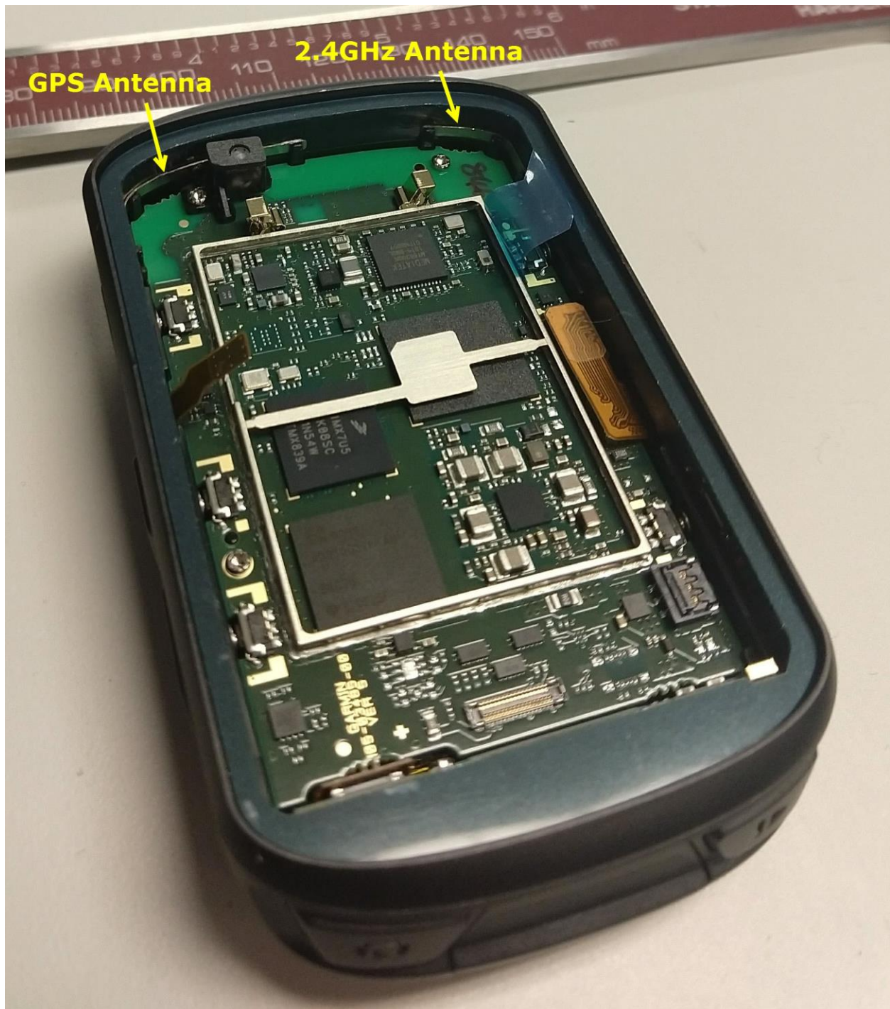
Location of antennas.