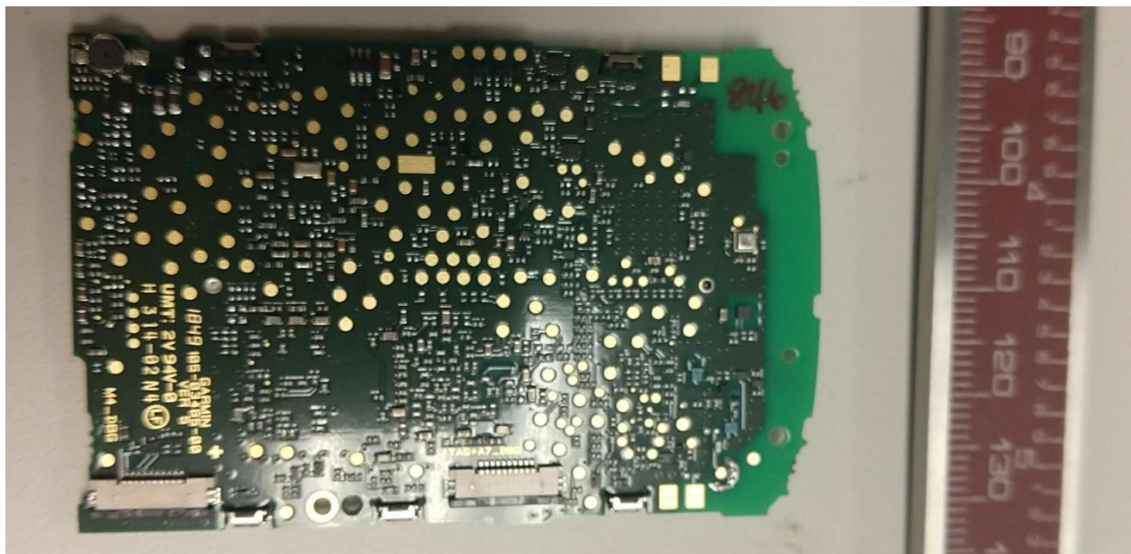
Bottom of PCB