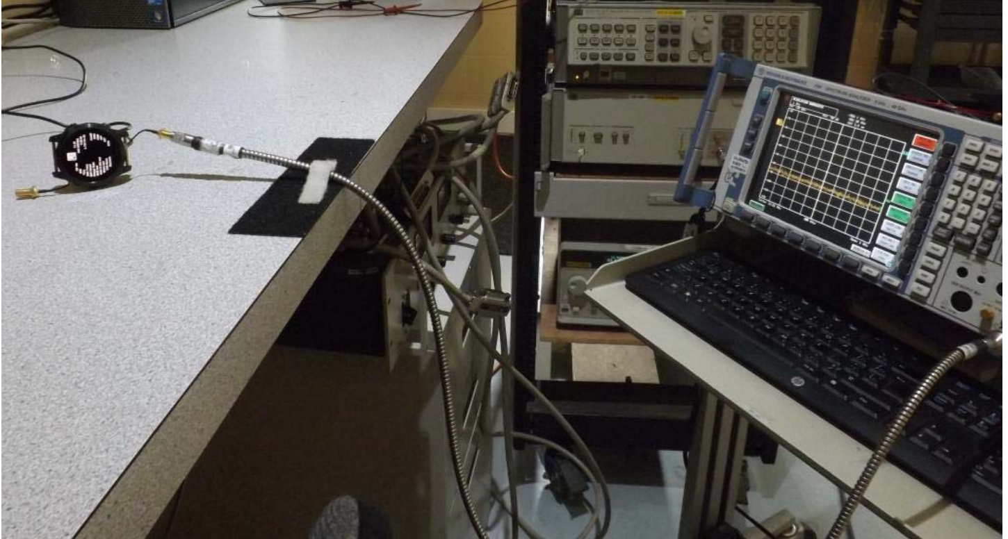
Figure E16.1 – Setup, Conducted Measurements