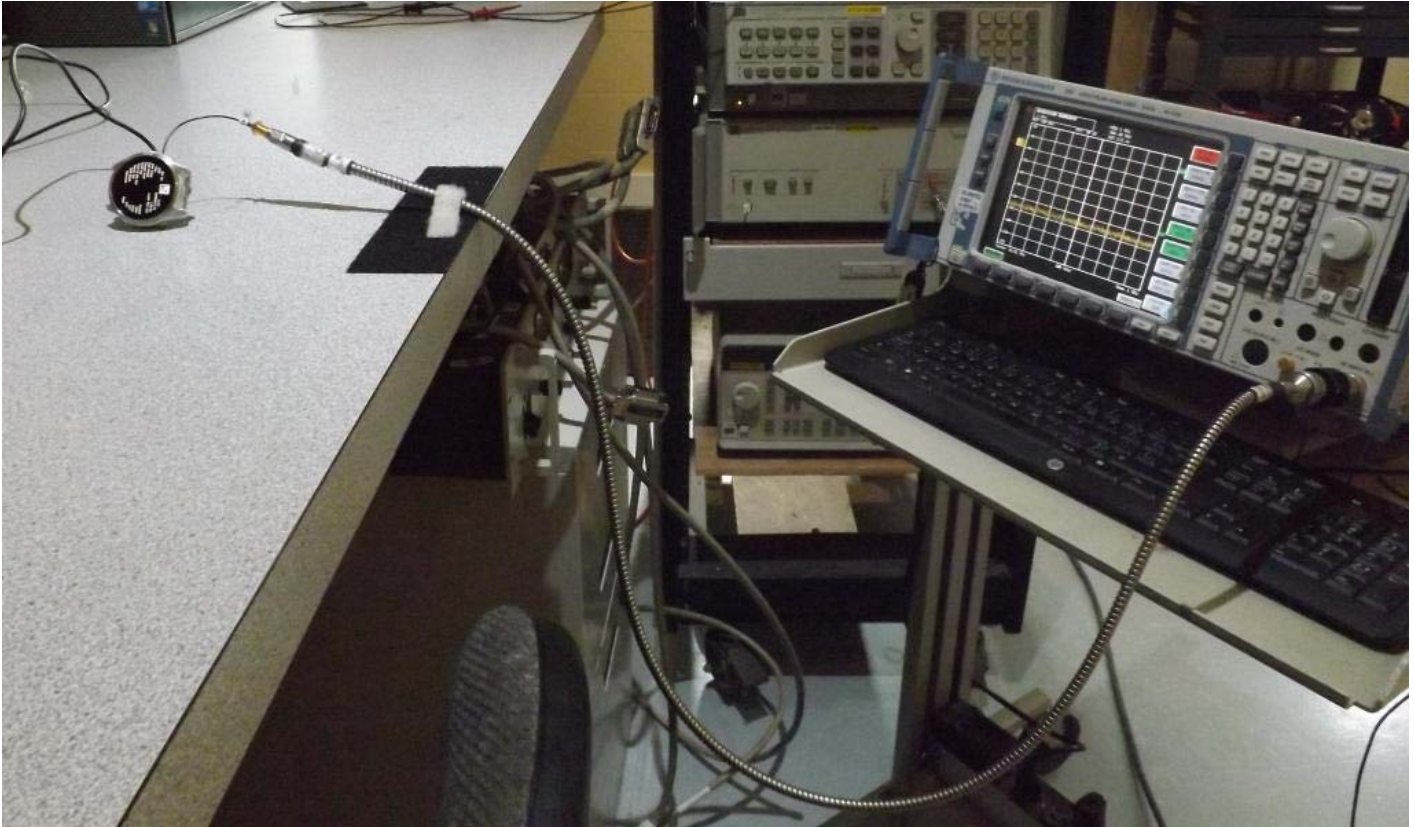
Figure E16.1 – Setup, Conducted Measurements