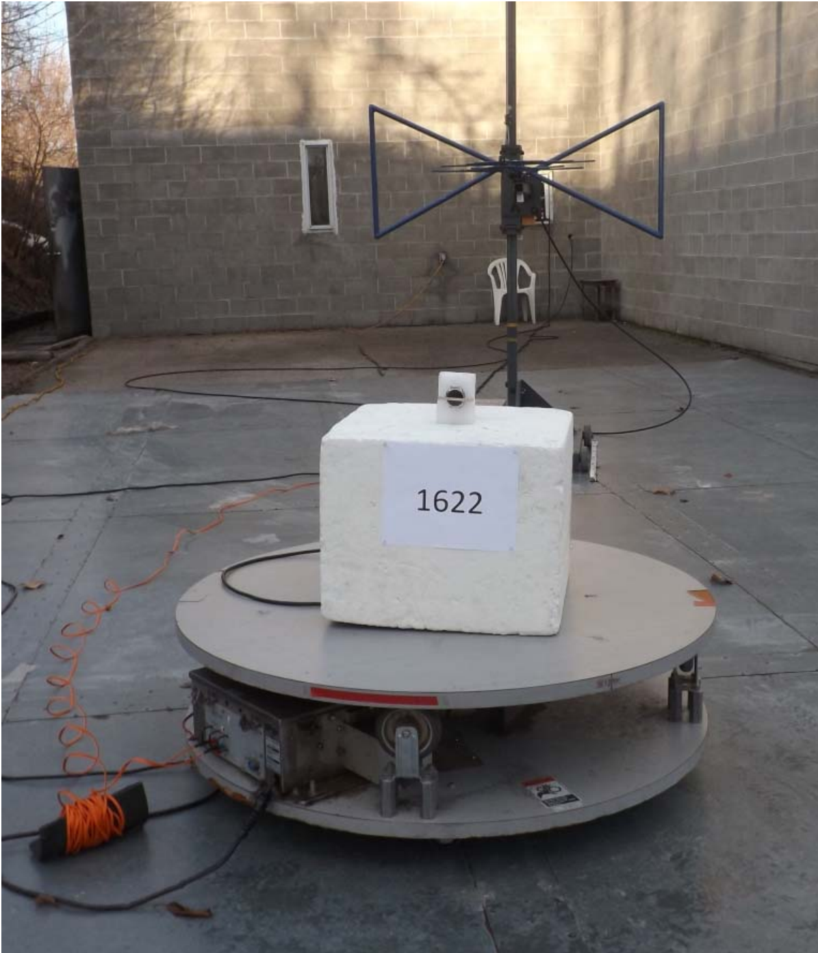
Figure E16.4 – Setup, Radiated Measurements, 1 – 18GHz