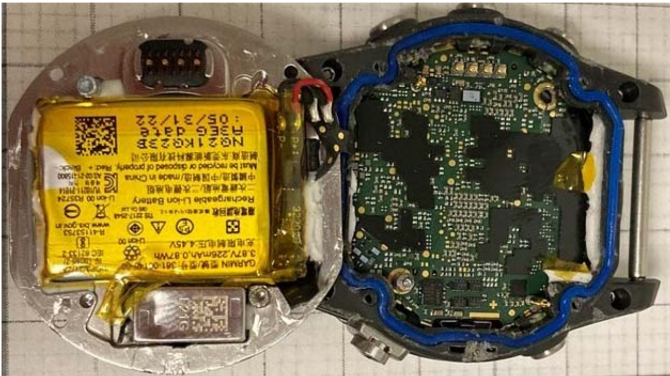
Figure E15.1 – Internal, Back Cover Removed