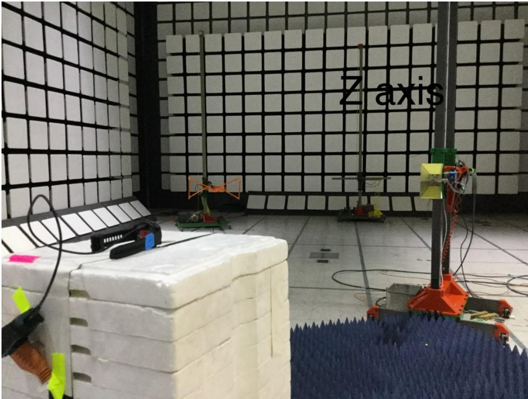
1 – 26 GHz Test Setup