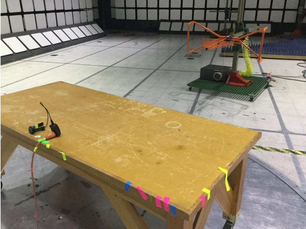
30 MHz – 1 GHz Test Setup