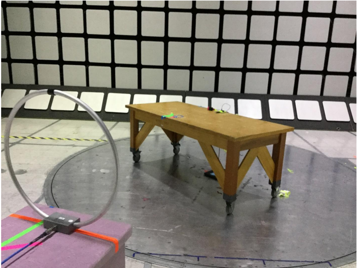
13 – 30 MHz Test Setup Photo