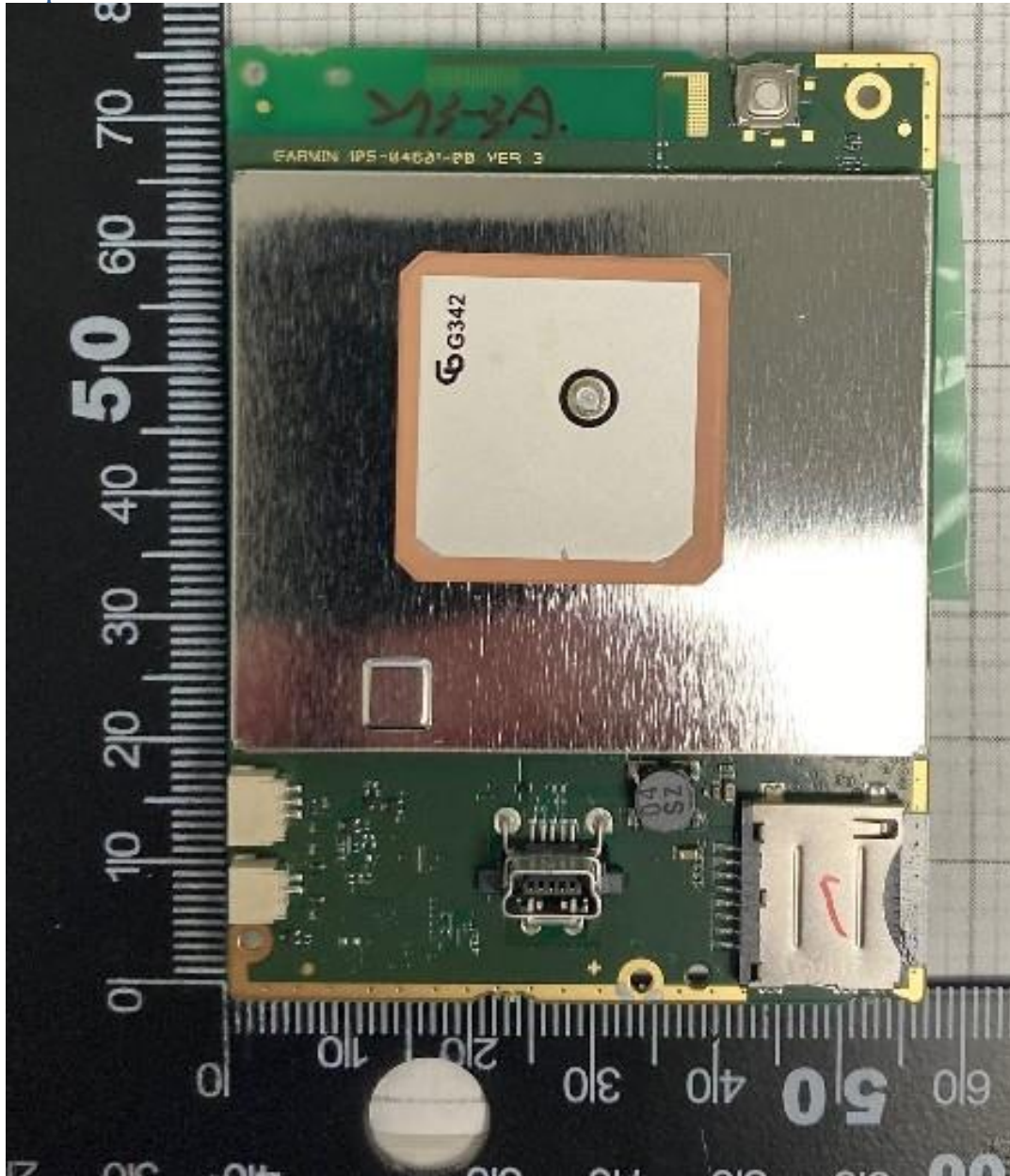
Top with Shield

Rogers Labs, Inc. 4405 West 259 th Terrace Louisburg, KS 66053 Phone/Fax: (913) 837-3214 Revision 1