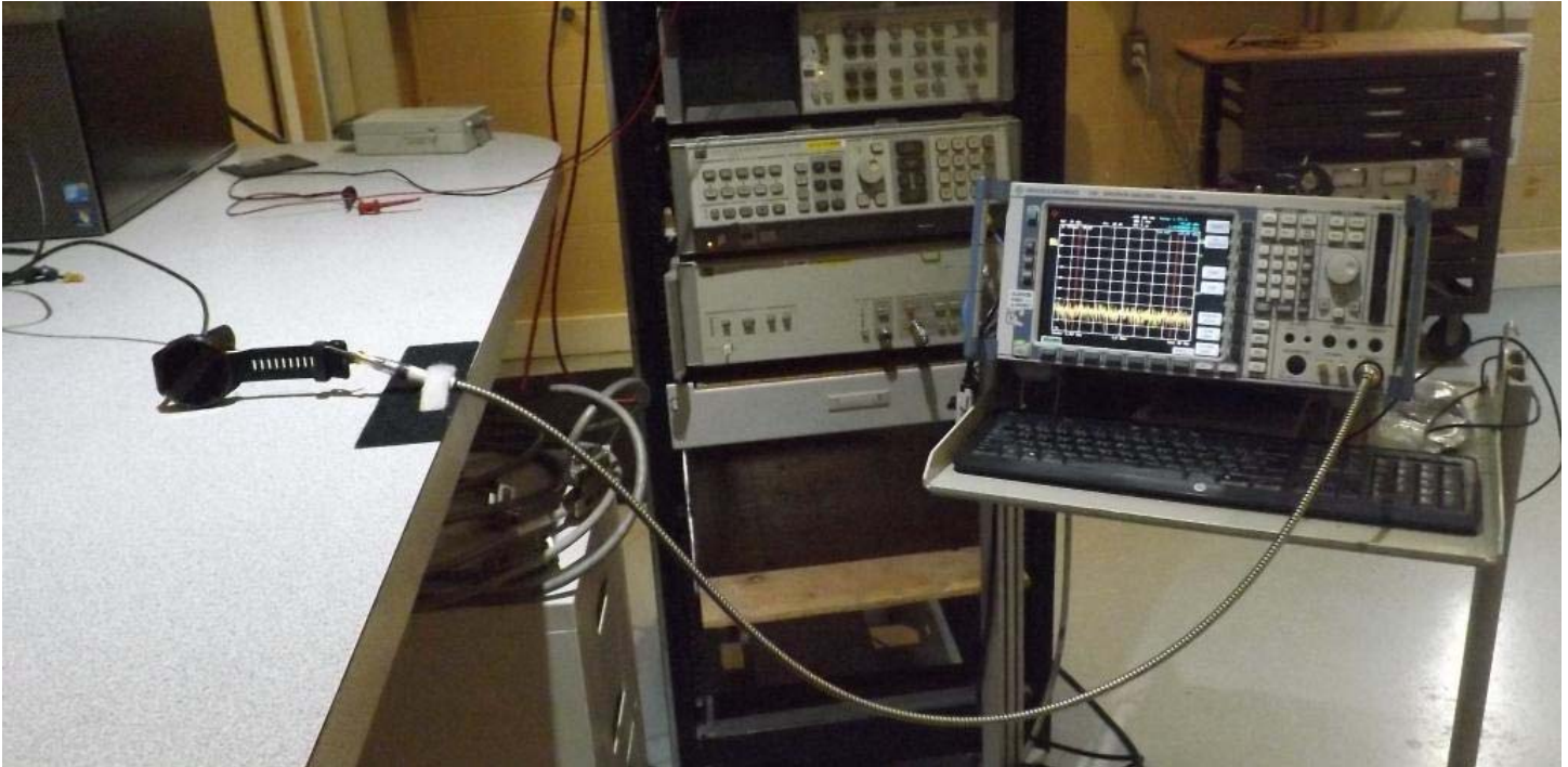
Figure E20.1 – Setup, Antenna Port Conducted