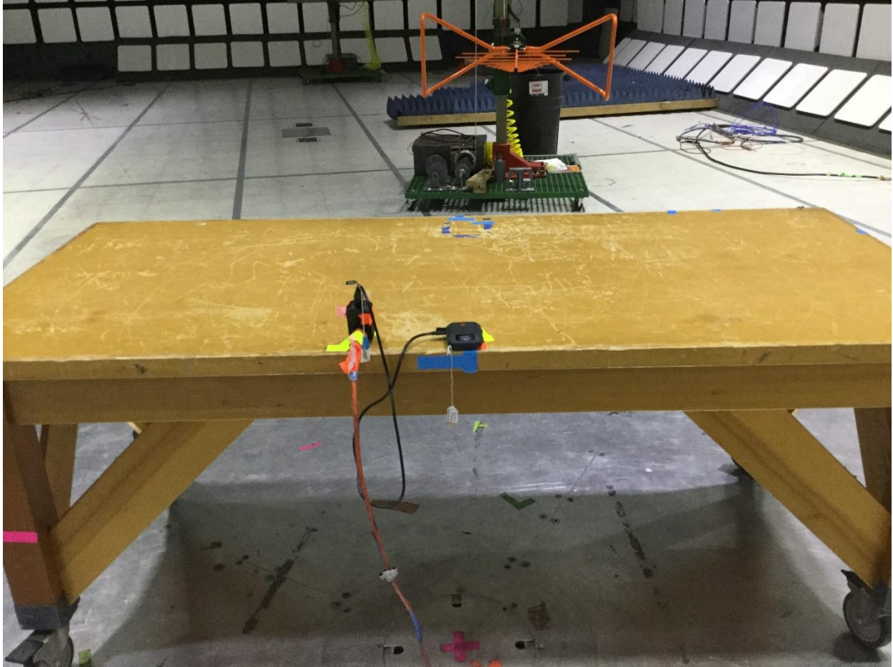
30 MHz – 1 GHz Test Setup