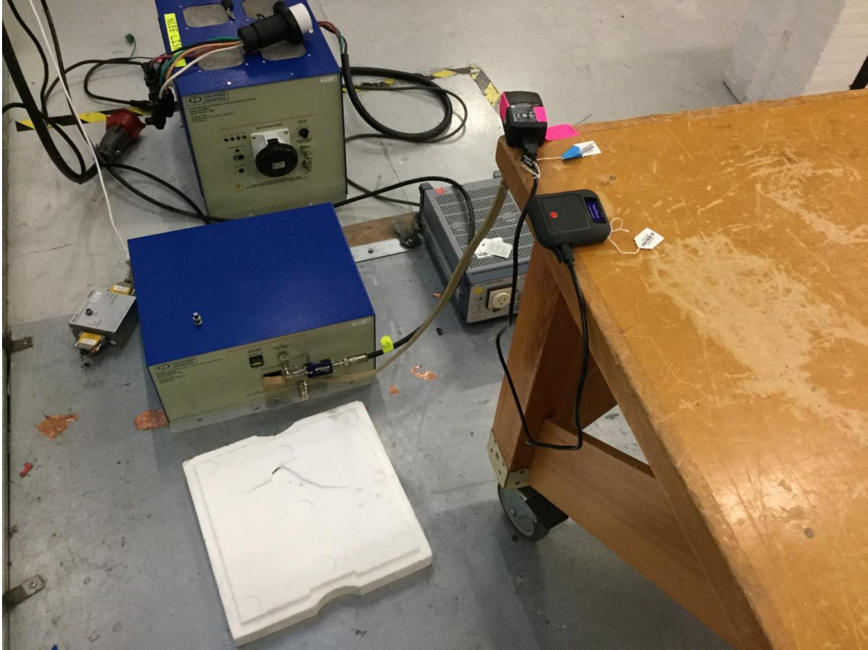
Conducted emissions test setup