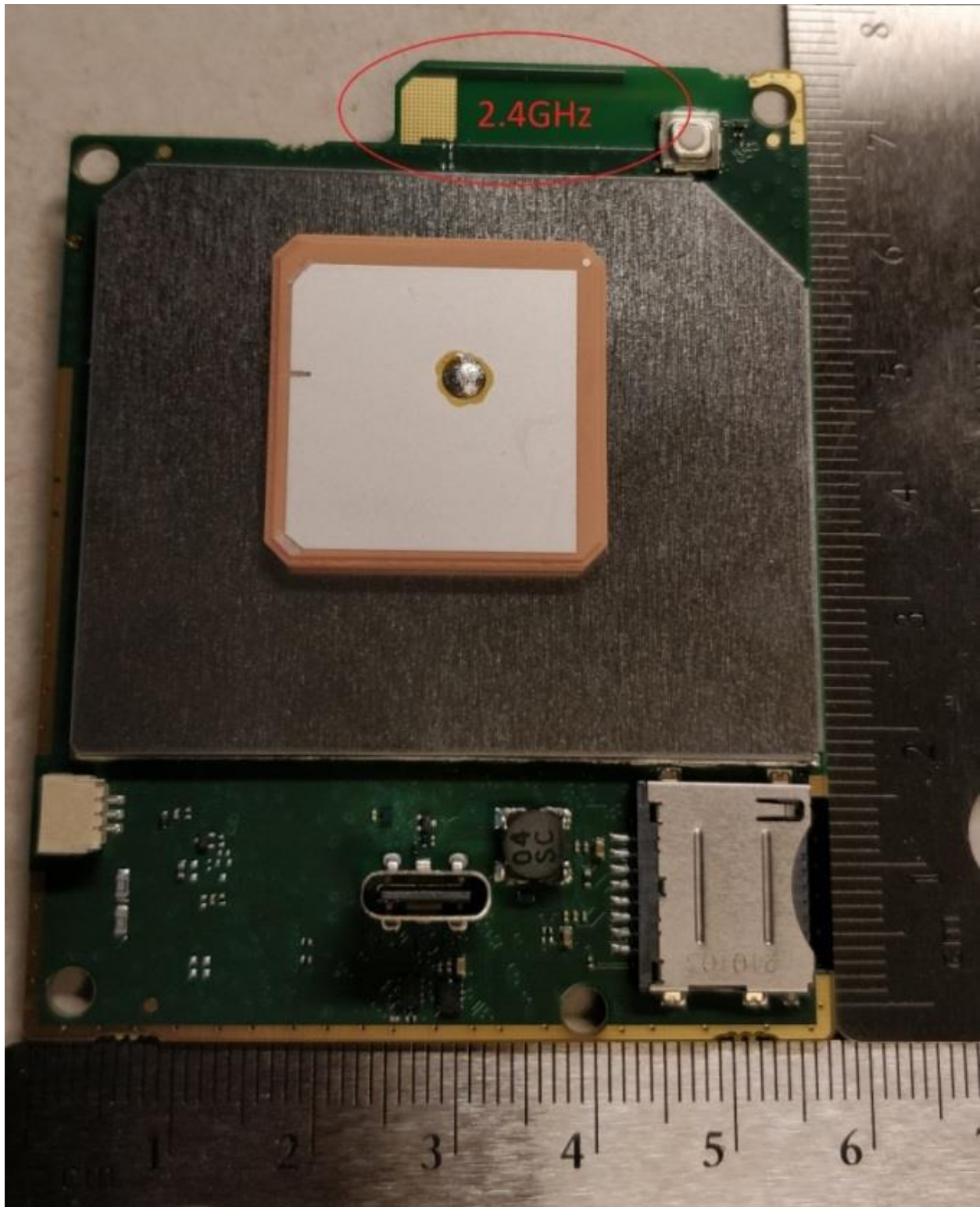
Back Side with Shield and 2.4 GHz Antenna

Rogers Labs, Inc. 4405 West 259 th Terrace Louisburg, KS 66053 Phone/Fax: (913) 837-3214 Revision 1