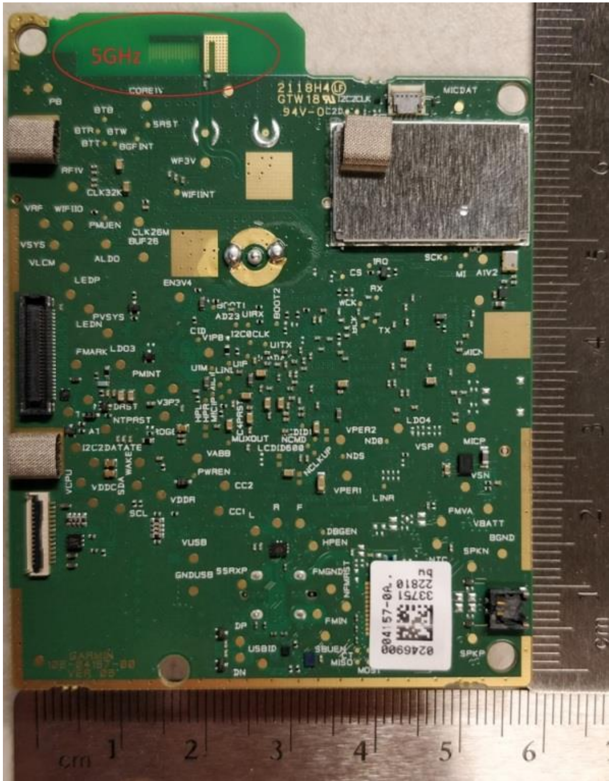
Front with shield and 5 GHz antenna

Rogers Labs, Inc. 4405 West 259 th Terrace Louisburg, KS 66053 Phone/Fax: (913) 837-3214 Revision 1