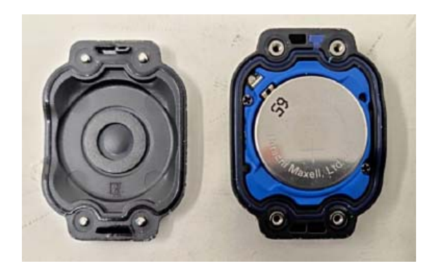
Figure E19.1 - Internal Photo - Back Cover / PCB Removed