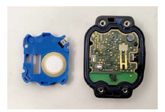
Figure E19.2 - Internal Photo -Cover / PCB