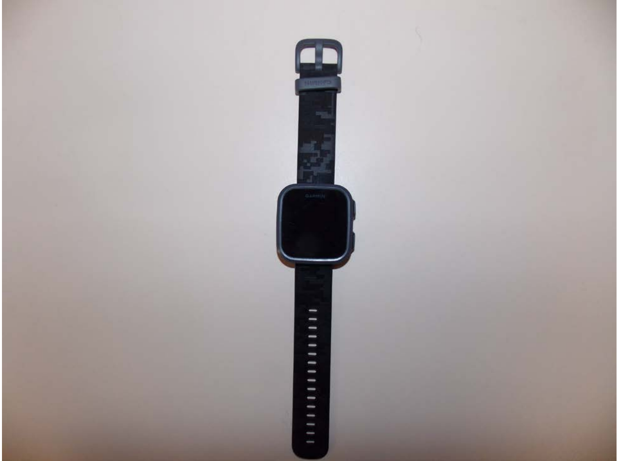
Front of Device