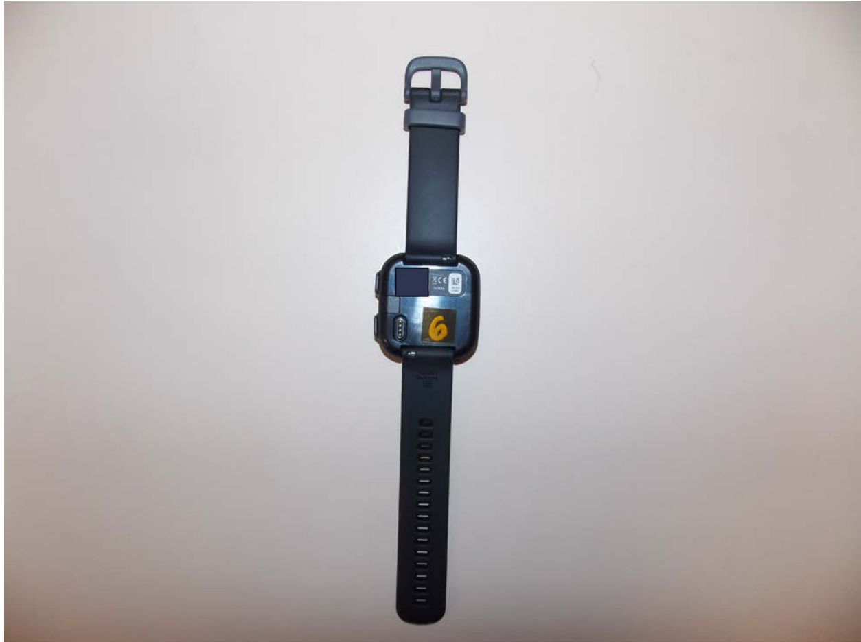
Back of Device