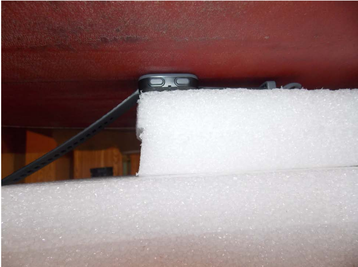
Test Position Back 0 mm Gap