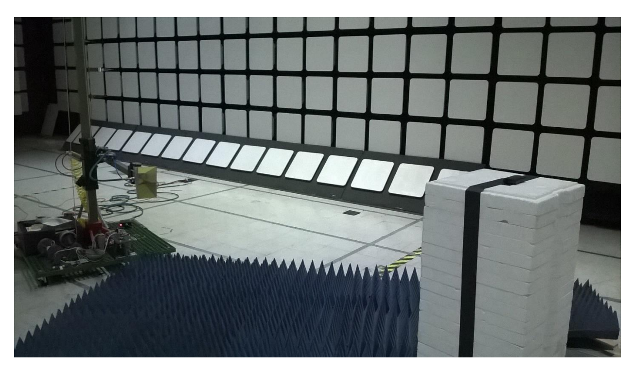
Figure 1 - Radiated Emissions Test Setup, 1 - 25 GHz (EUT not shown. Photo intended to show equipment setup)