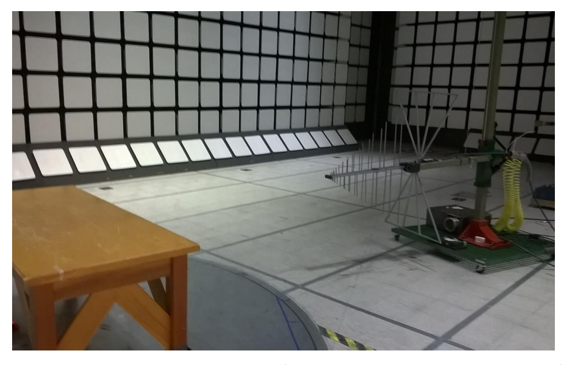
Figure 2 - Radiated Emissions Test Setup, 30 MHz - 1 GHz (EUT not shown. Photo intended to show equipment setup)