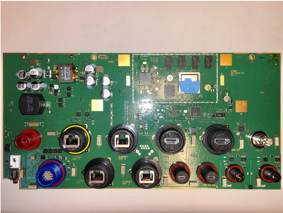
Figure 2 - PCB FRONT