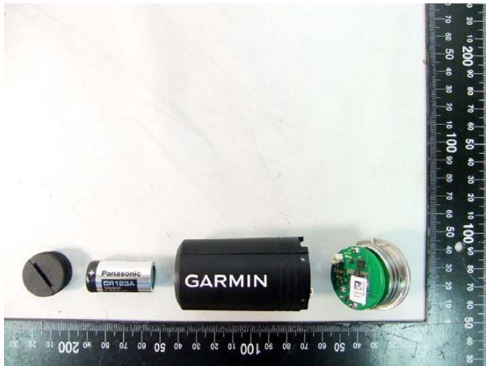
Figure 1 - EUT Components