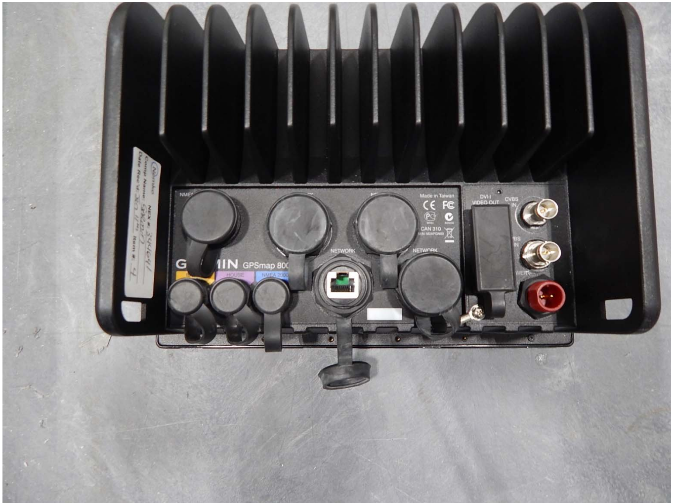
Figure 1.1-2: Rear view photo (Plotter)