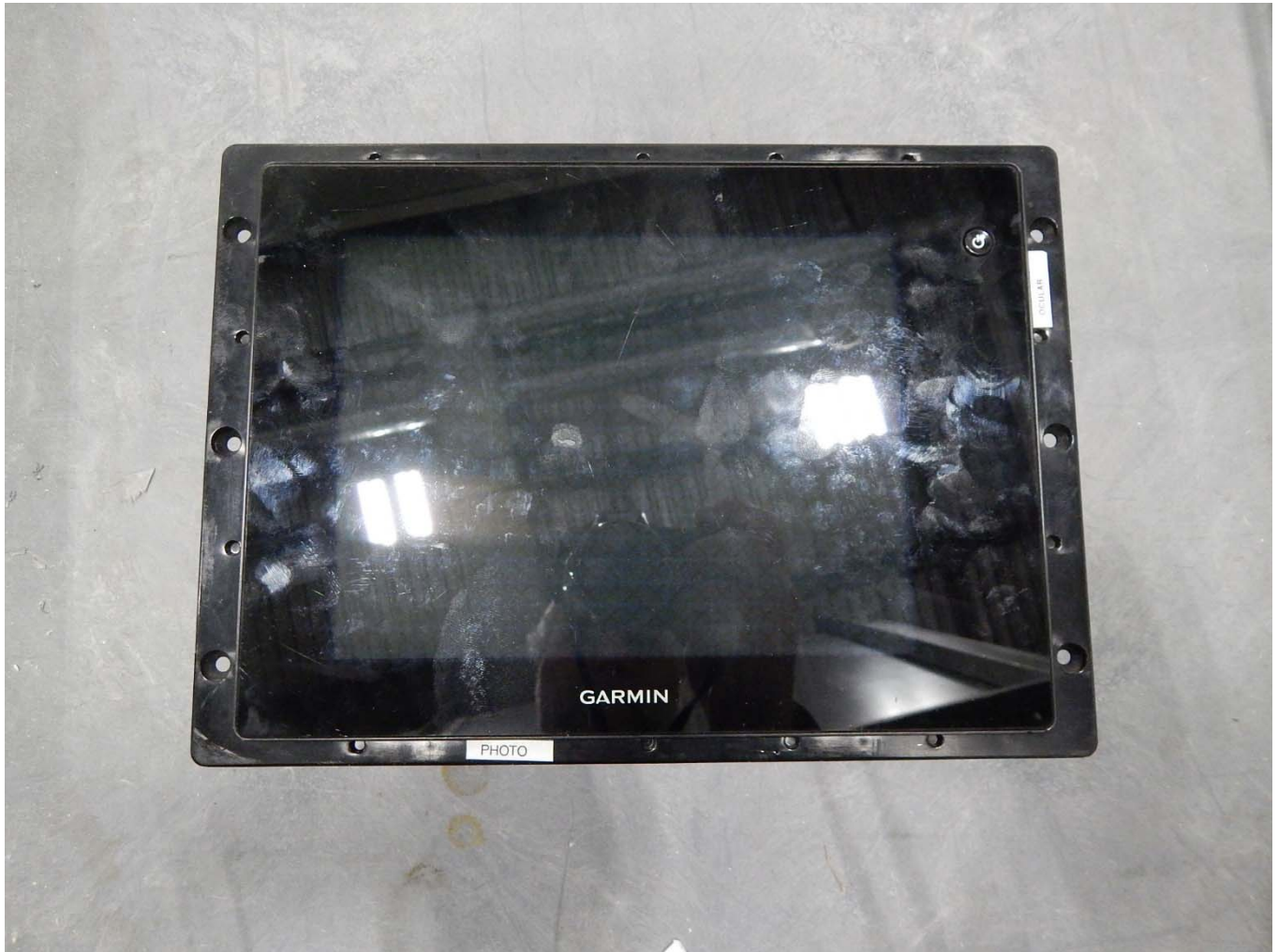
Figure 1.1-1: Front view photo (Plotter)