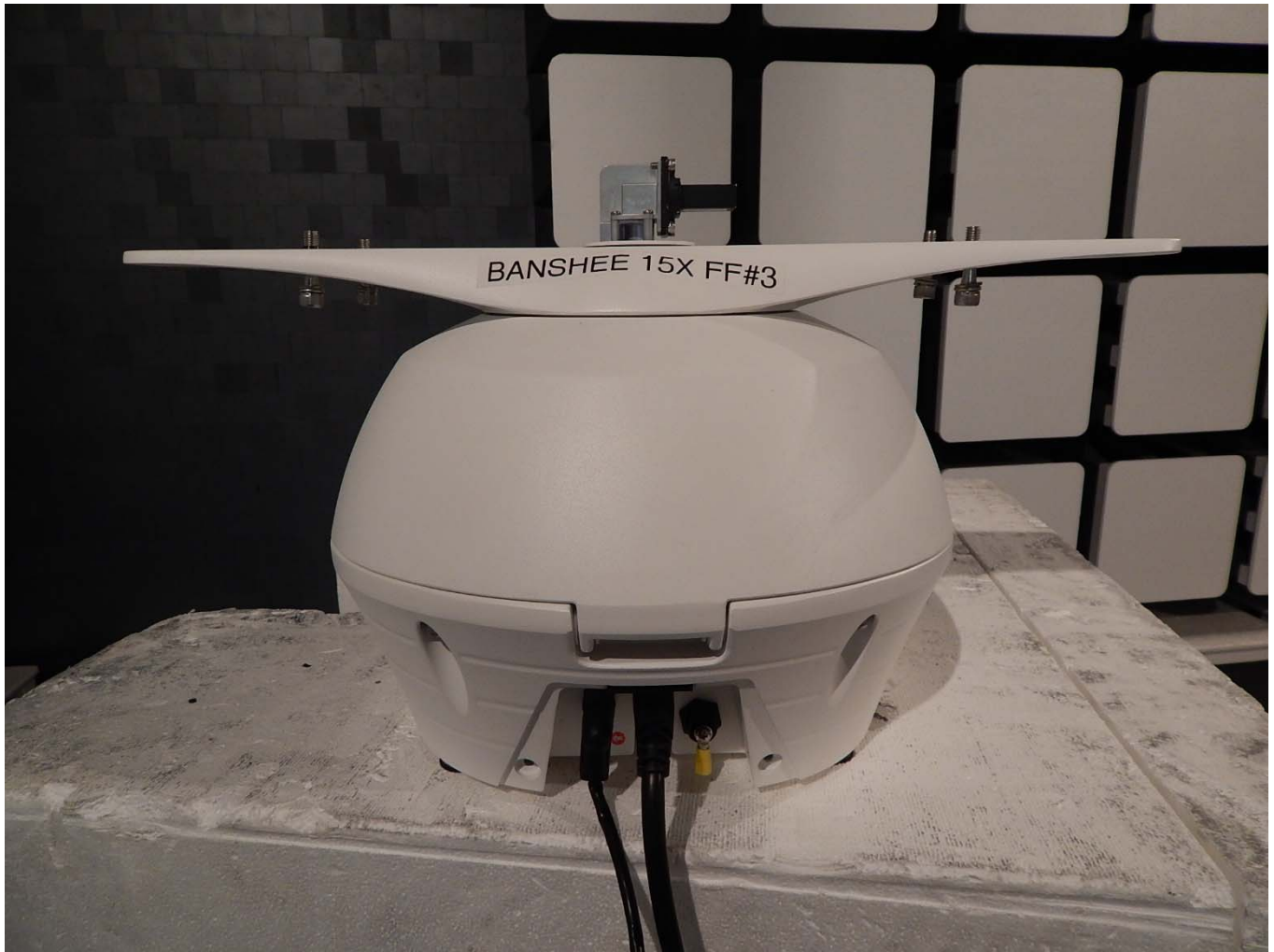
Figure 1.1-3: Top view photo