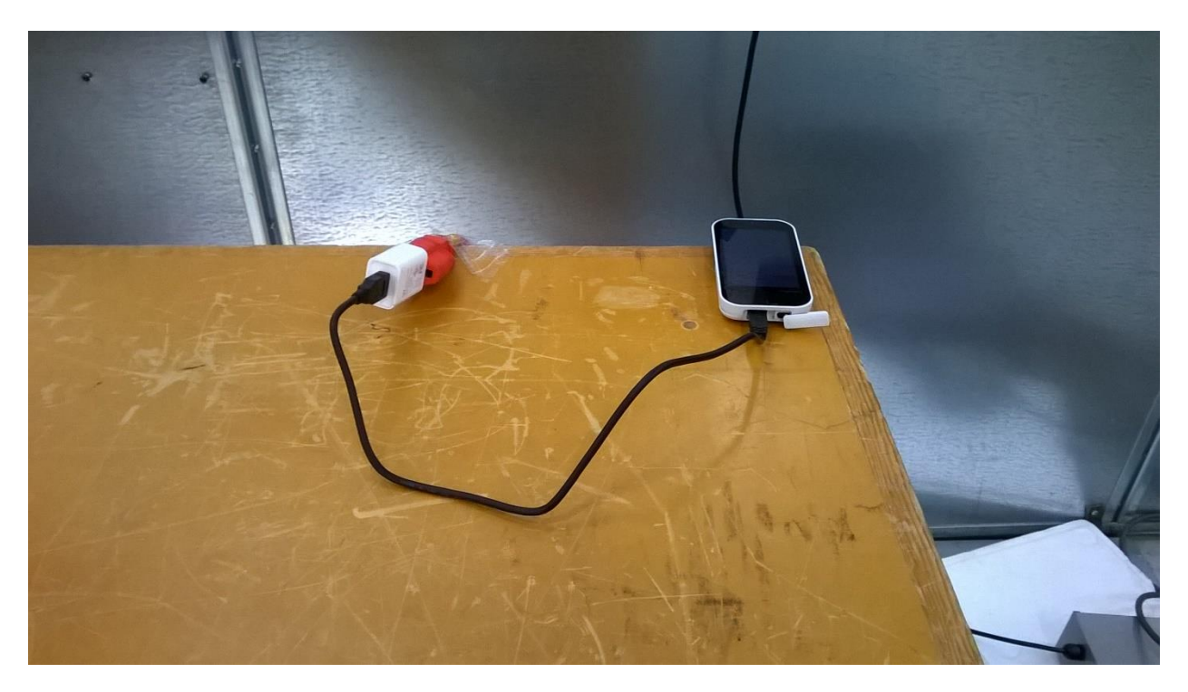
Figure 9 – Conducted Emissions Test Setup