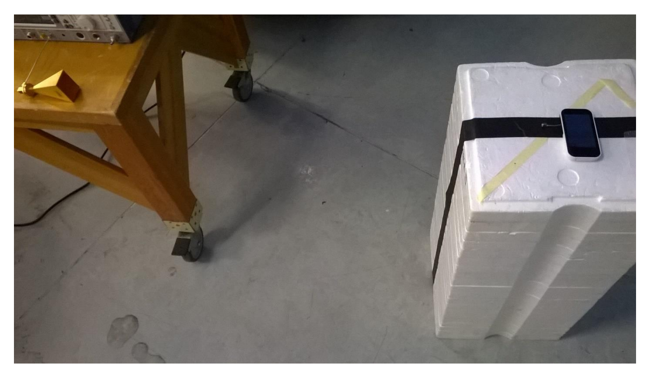
Figure 7 – Radiated Emissions Test Setup, 40 – 50 GHz