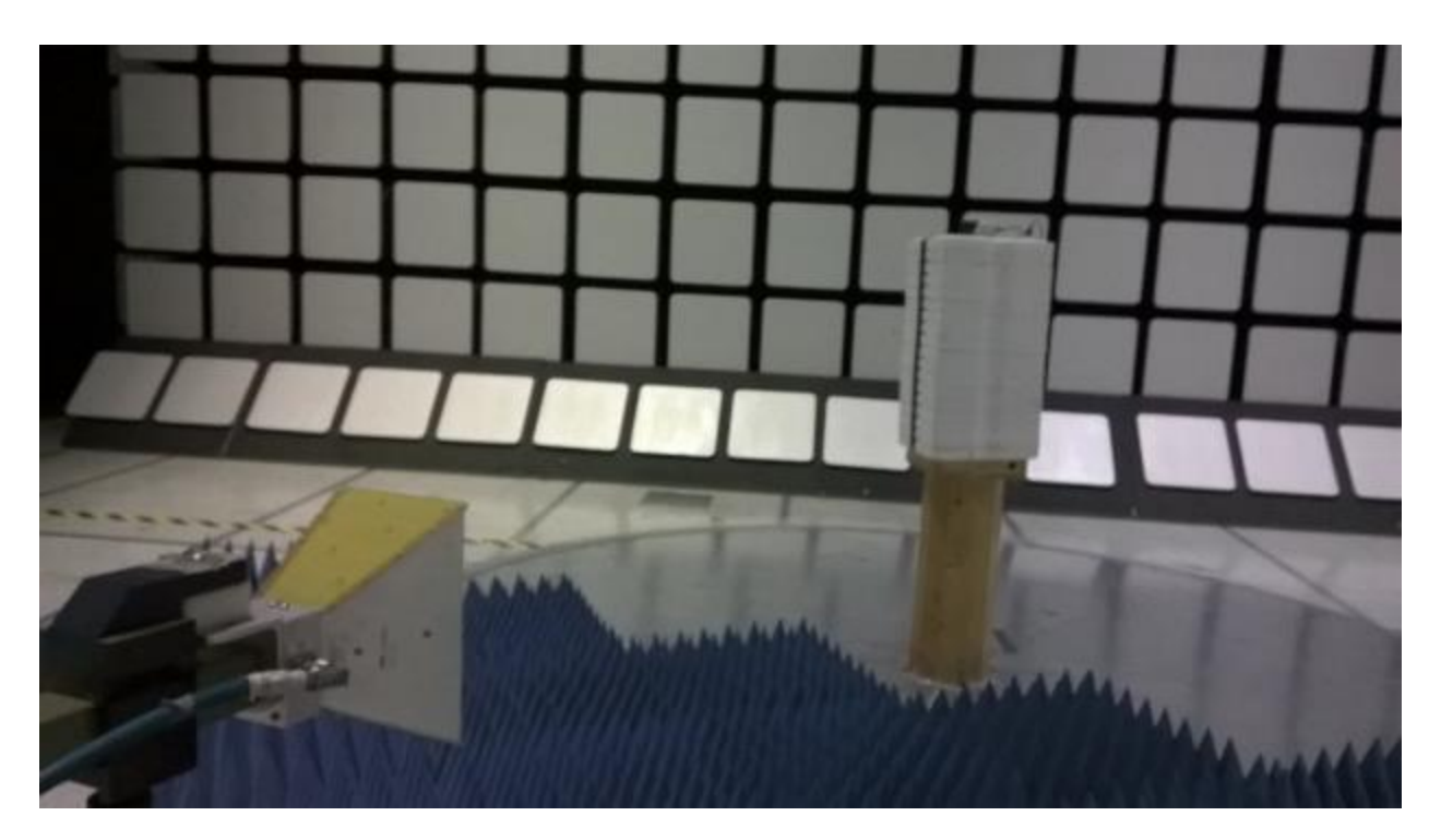
Figure 1 - Radiated Emissions Test Setup, 1 - 25 GHz