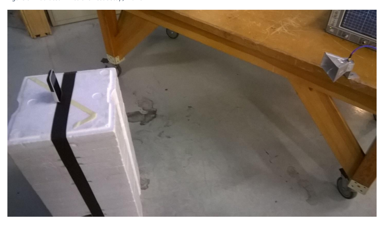
Figure 6 - Radiated Emissions Test Setup, 26.5 – 40 GHz