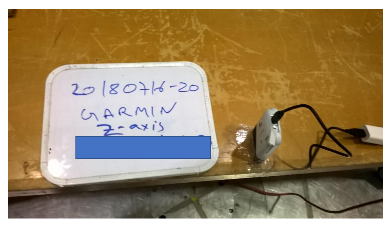
Figure 5 - Radiated Emissions Test Setup, Z-axis