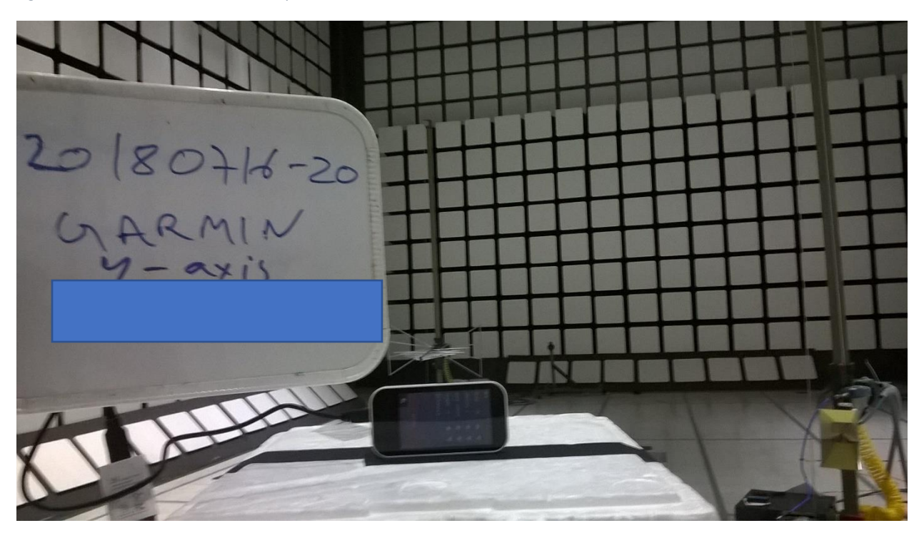
Figure 4 - Radiated Emissions Test Setup, Y-axis