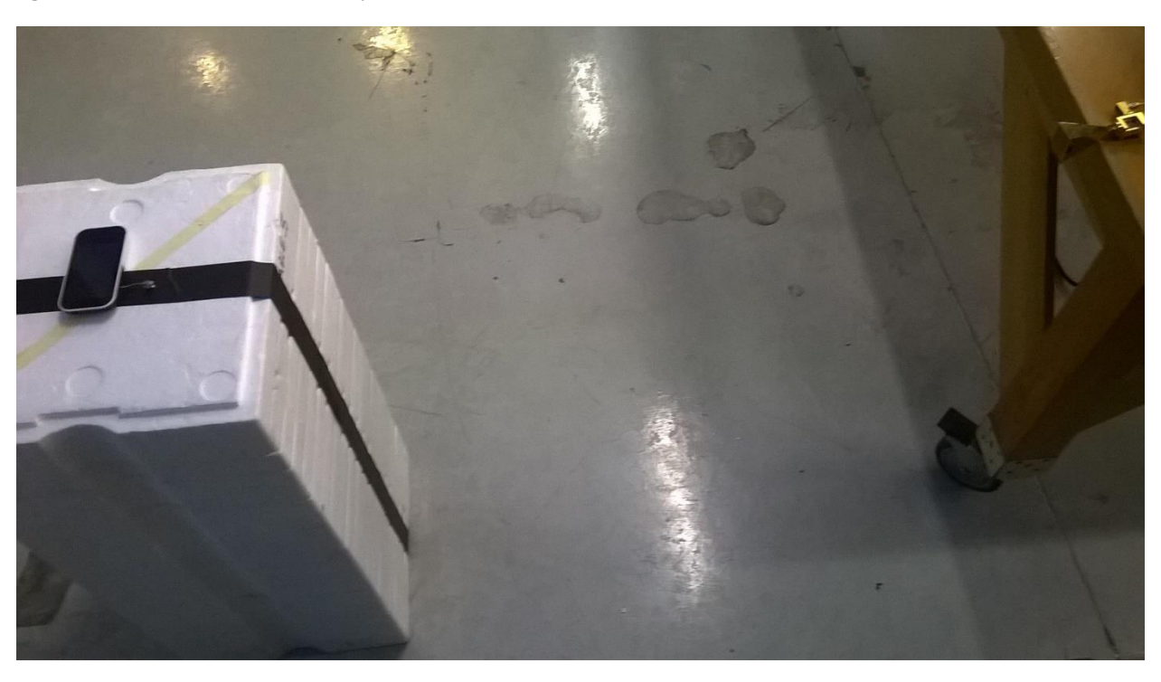
Figure 8 - Radiated Emissions Test Setup, 50 - 75 GHz