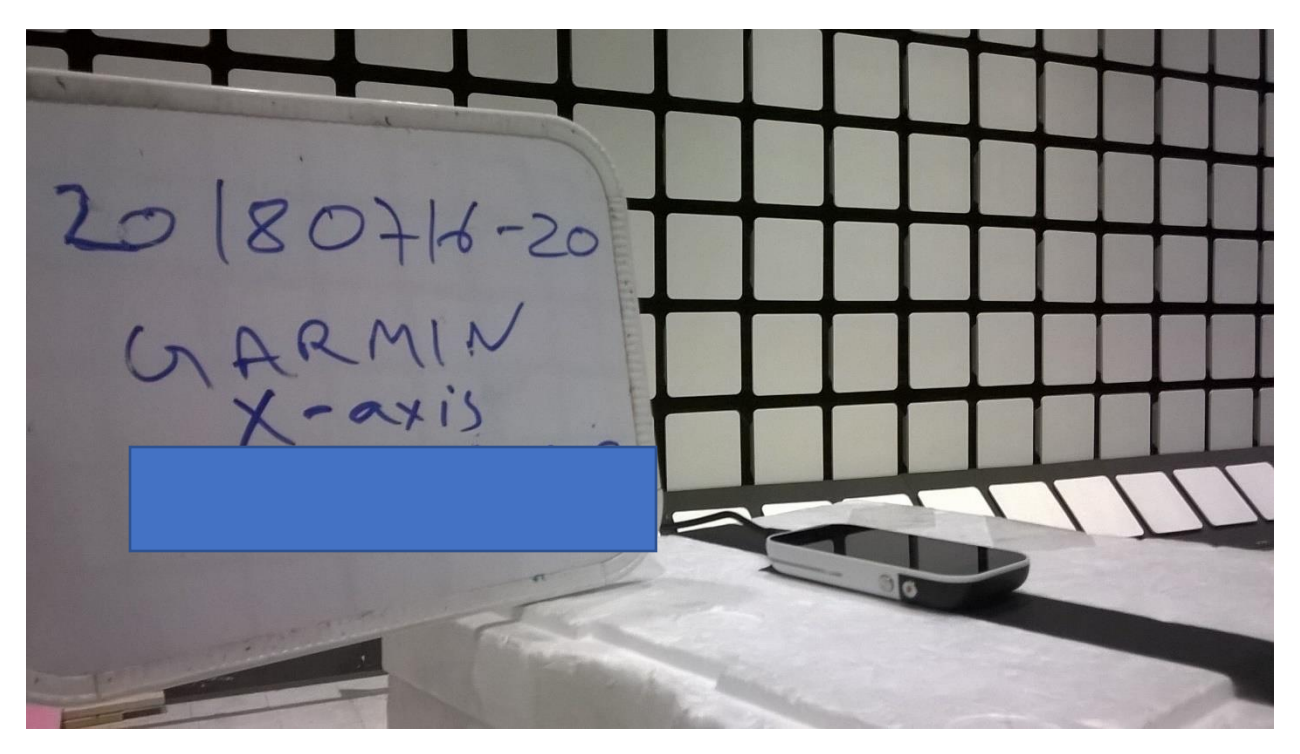
Figure 3 - Radiated Emissions Test Setup, X-axis