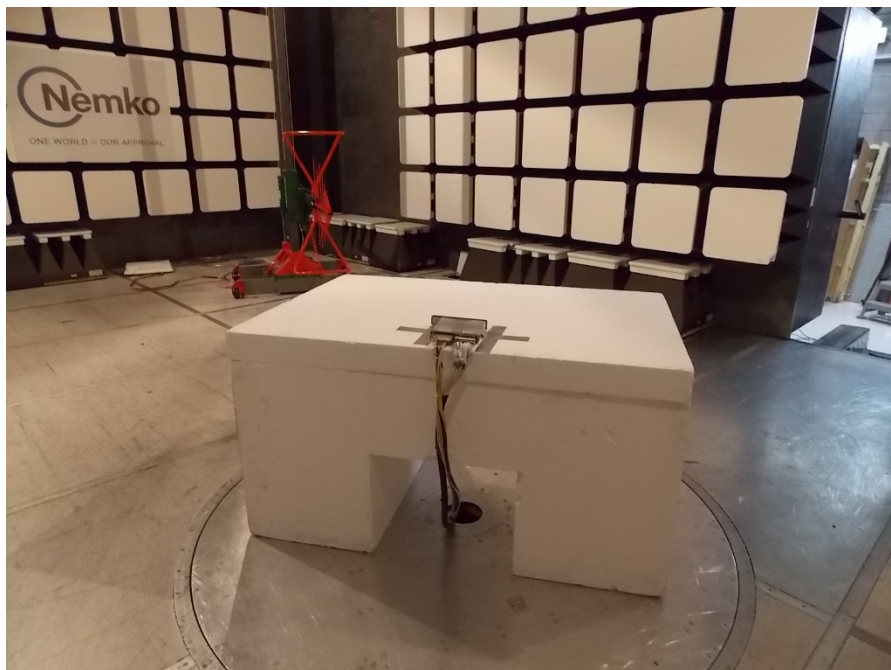
Radiated spurious (out-of-band) emissions setup photo – 30 to 1000 MHz