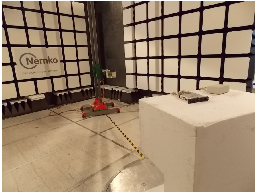
Radiated spurious (out-of-band) emissions setup photo – above 1 GHz