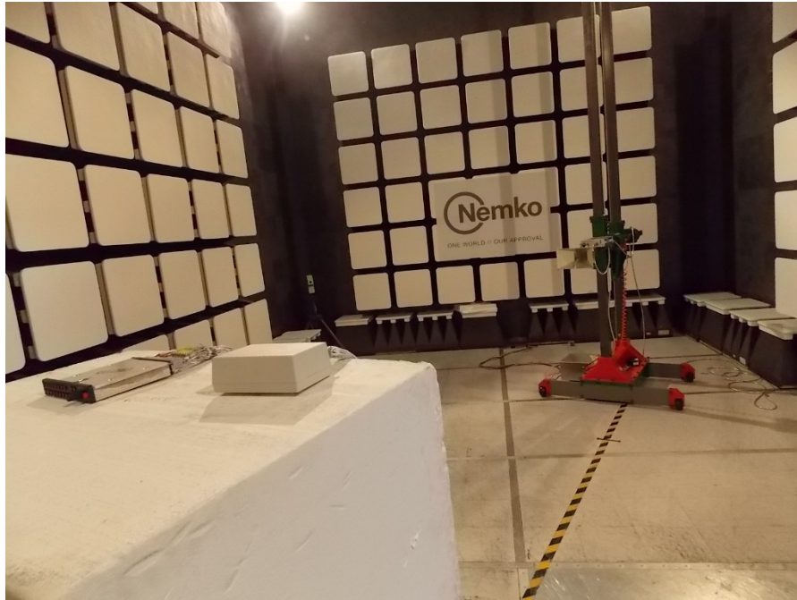
Radiated spurious (out-of-band) emissions setup photo – above 1 GHz