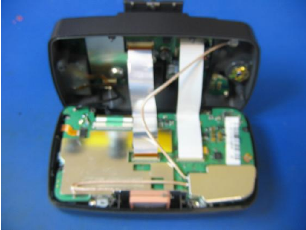
Transmitter board with shield.

Internal photographs of transmitter section of equipment under test. Inside with unit opened.