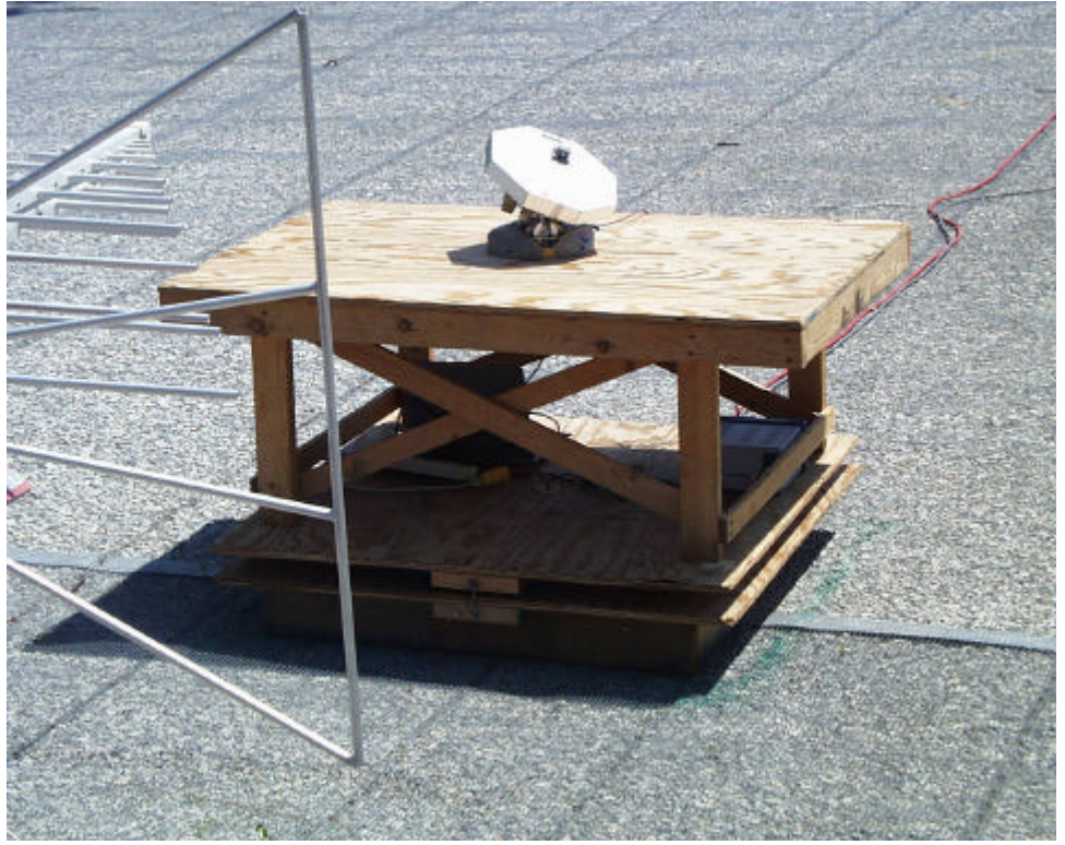
General emissions setup with load over antenna.

ROGERS LABS, INC.Garmin International, Inc.4405 W. 259th TerraceMODEL: GWX 68Louisburg, KS 66053Test #: 050517FCCID#: IPH-0060200Phone/Fax: (913) 837-3214Test to: FCC Parts 2 and 87Page 1 of 2<br/>IPH0060200 TstPhot.doc 5/23/2005