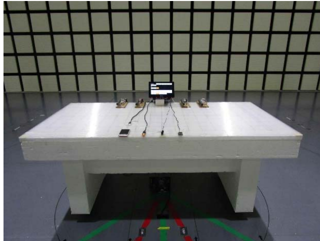
Rear (below 1 GHz)