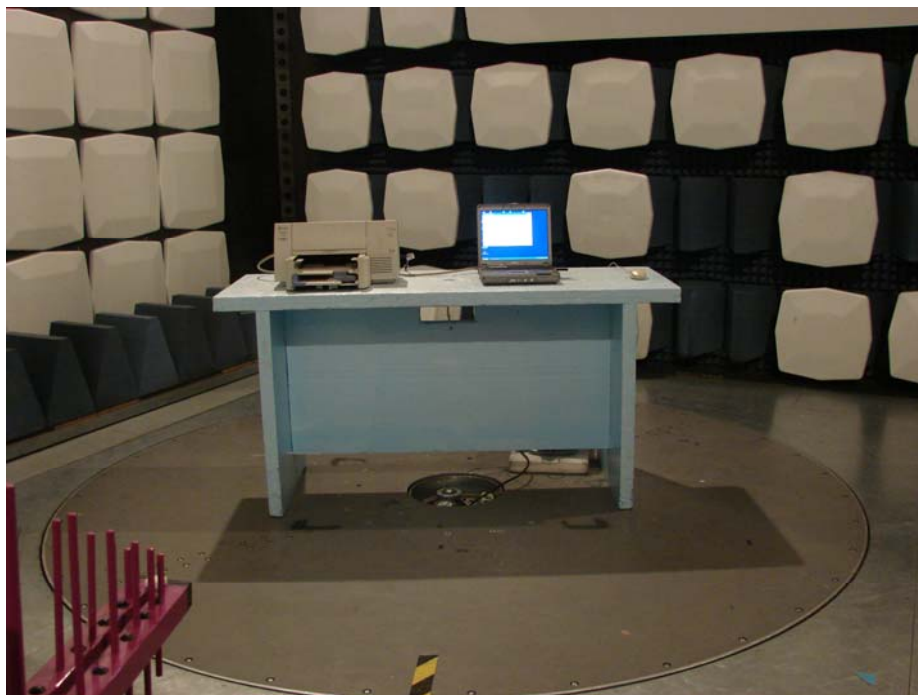
Picture 4 Radiated emission test setup