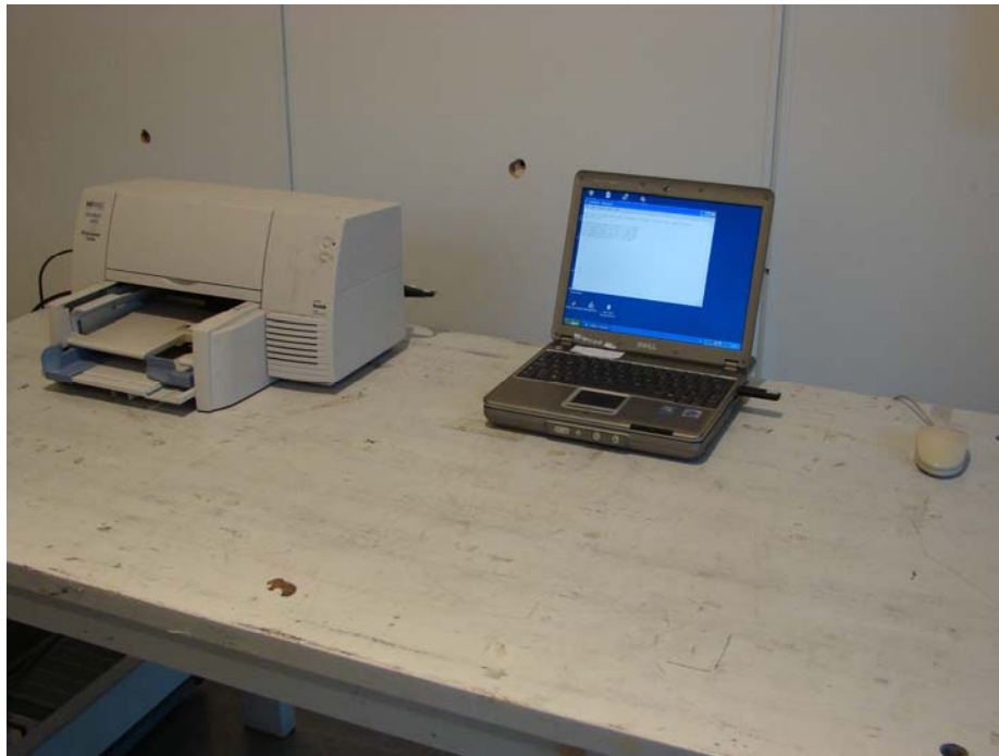
Picture 3 Test setup for measurement of conducted emissions to AC-mains