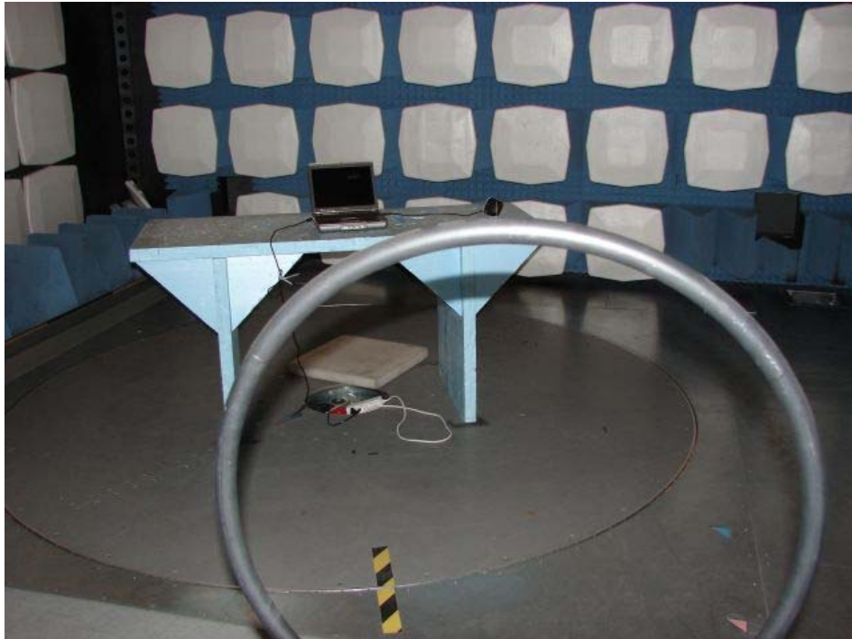
Picture 1: Field strength and spurious emission 9 kHz-30 MHz test setup