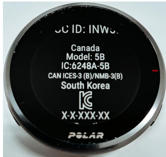
Figures 8 & 9. About watch, certificate IDs visible.