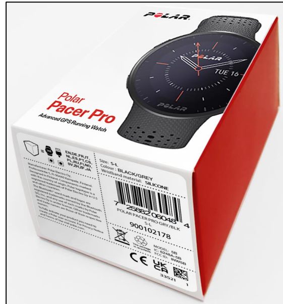
Figures 10 & 11. Sales box.