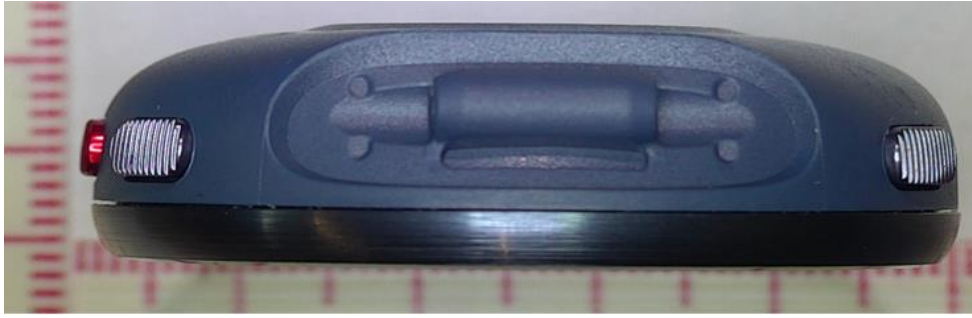
Figure 7. Side view, wrist band fastening location.